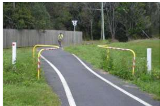
Cycle ways encourage the use of active transport modes that reduce greenhouse gas emissions and the community's reliance on fossil fuels.

Although Climate change and Peak oil are significant challenges they can also be seen as drivers for change towards more sustainable practices. In this instance a real opportunity has been granted to solve two problems at once. Through lowering the dependence on fossil fuels both greenhouse gas emissions and operating costs can be reduced. In addition, the development of new technologies and products that are less reliant on fossil fuels will foster economic growth and resilience.