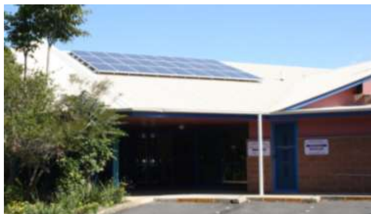
Solar panels on the Brunswick Heads Community Centre reduce greenhouse gas emissions by supplementing the centre's energy use with electricity made from the sun.