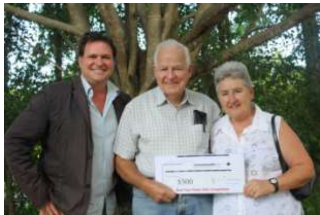
Byron Shire resident winners of “Beat your power bills competition” saved the most on their electricity bills by implementing a suite of easy changes in the home.