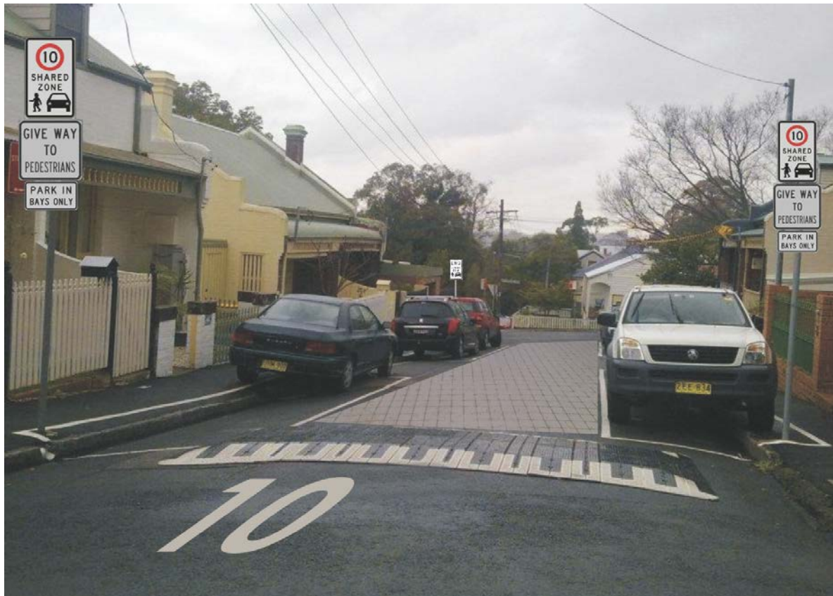
Figure 2. Photo and diagram of a Category 2 shared zone showing treatments, traffic calming, parking provision, and typical layout. 'Give Way' to Pedestrian' pavement marking is optional.

The photo may have been modified to demonstrate essential elements.