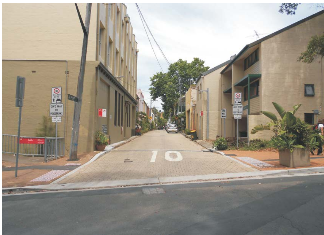
Figure 2. Photo and diagram of a Category 1 shared zone retaining kerb and gutter showing treatments, parking provision, and typical layout. The photo may have been modified to demonstrate essential elements.