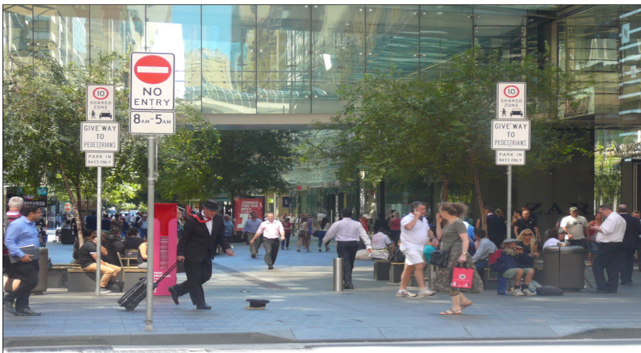
Figure 1. Photo and diagram of a Category 1 shared zone showing regulatory signage, typical layout and treatments. [Note: The No Entry sign is site specific] The photo may have been modified to demonstrate essential elements.