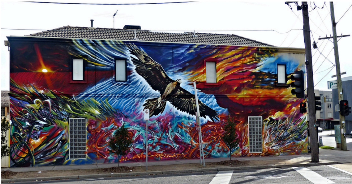
City of Eastwood Commission