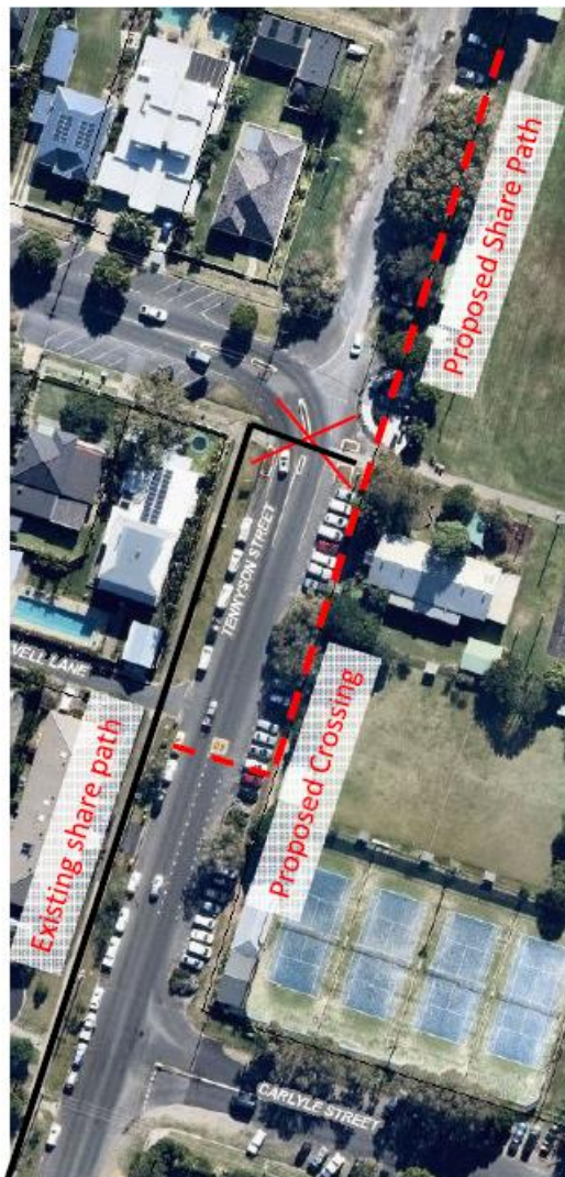
Figure 2 – Marvel Lane crossing

The committee agreed that community consultation needs to occur first.