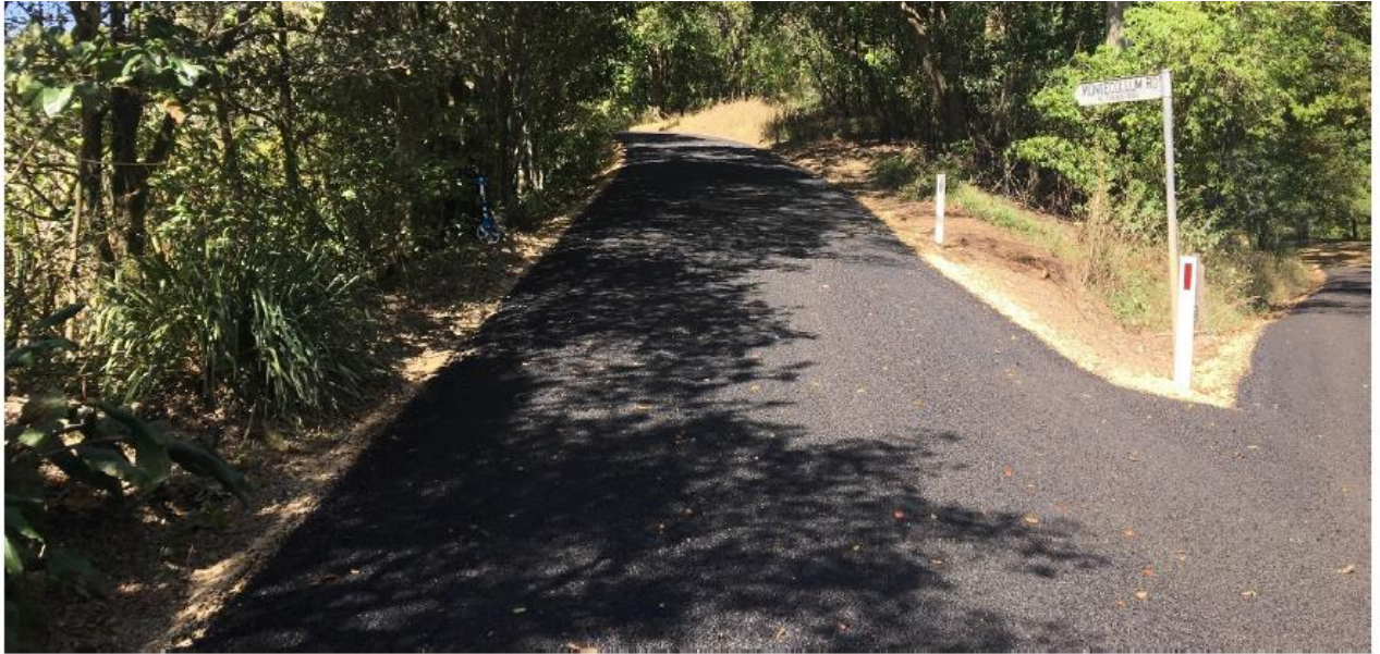
Figure 4 – Montecollum Road, from chainage 0m looking east Source of image: GAA, 19 September 2018