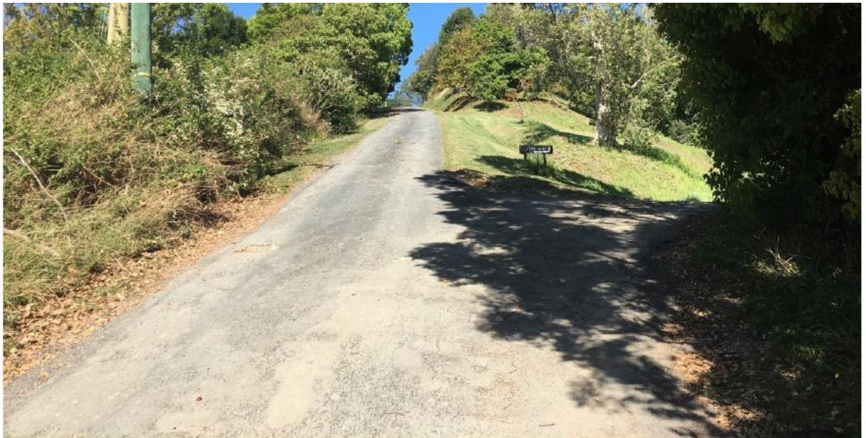
Figure 8 – Montecollum Road, Chainage ~500m looking east - driveway Source of image: GAA, 19 September 2018

Shanahan: Road rules provide for requirement of vehicles exiting driveways or at T intersections to stop and give way. Ian can work with Traffic Engineer to look into this intersection and the surrounding area. Suggested “Intersection Ahead” warning sign on Cedar Rd, etc.