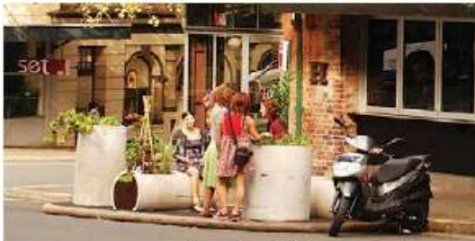
Temporary spaces explore potential future use and can be economical ways to improve the public domain.