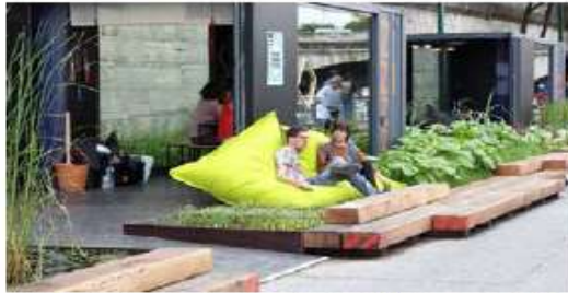
Utilising recycled materials is in tune with the ethos of the Bay community, it can also be cost effective.