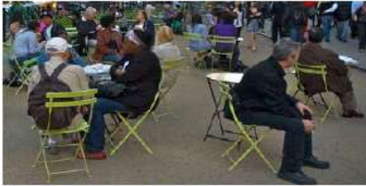
Movable furniture enables interaction with space and a unique opportunity to engage with the public realm.