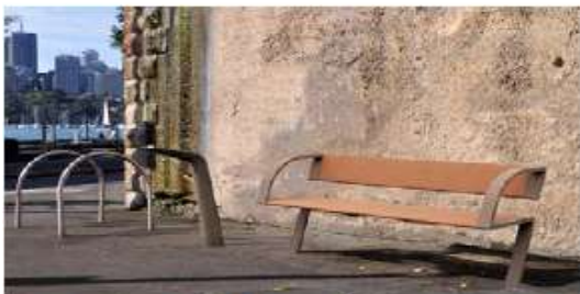
Street elements should be consolidated and co-located to avoid cluttering the street.