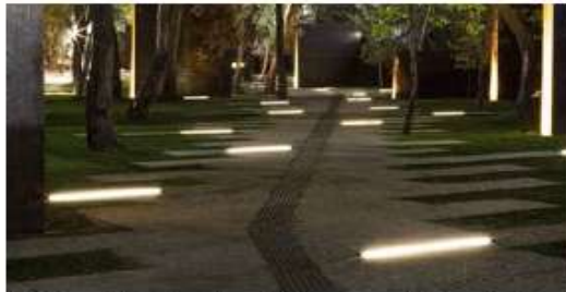
Lighting adds interest to public space and also extends usability into the night.