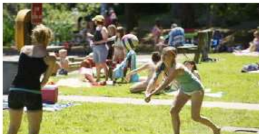
Open lawn areas provide space for a wide range of activities, including picnics, informal games or relaxing.