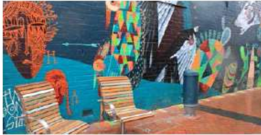
Natural materials and neutral colours are sympathetic to Byron's surrounding environment.