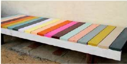
Colour can be used to reinforce key spaces and create vibrancy within selected areas e.g. laneways.