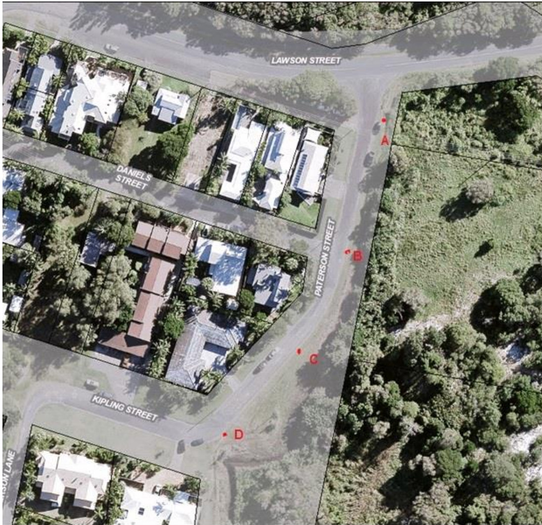
Figure 3. Paterson Street proposed signage locations