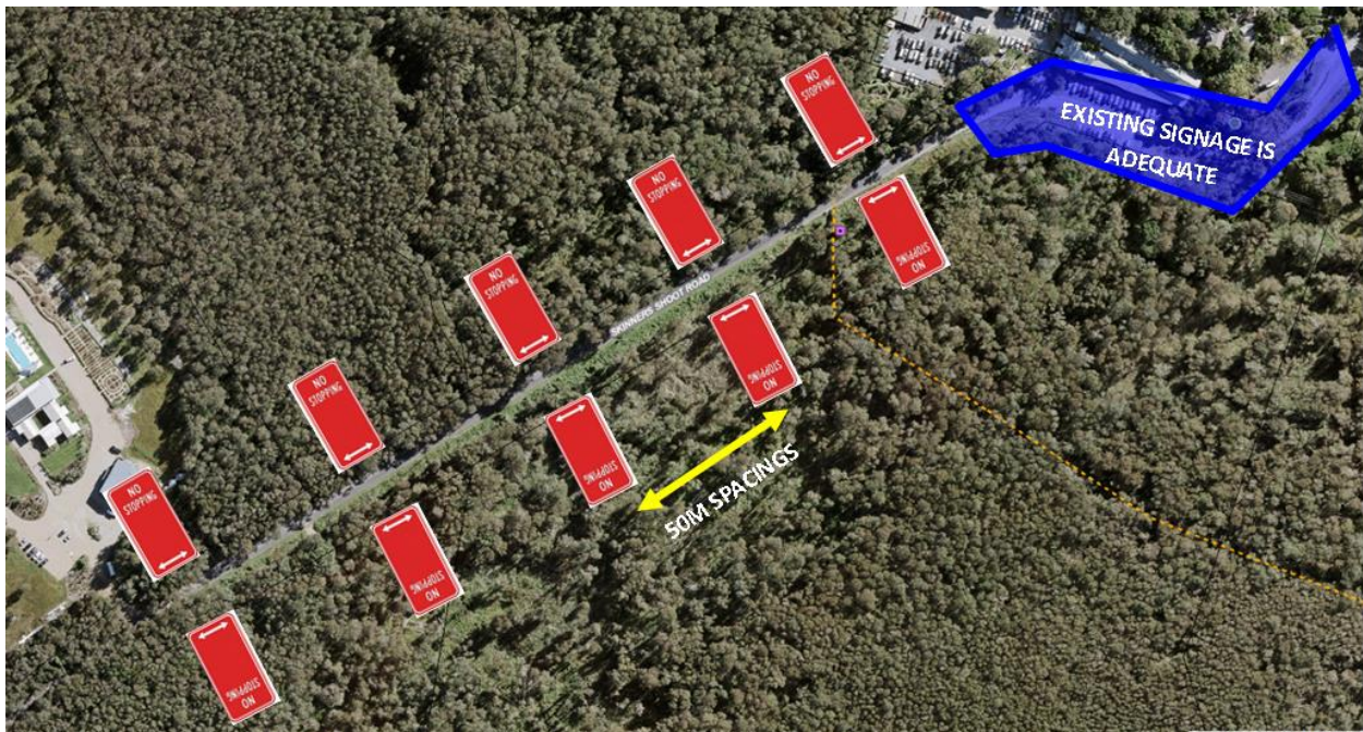
Figure 1: location of requested No Stopping signs.

Council has received a request from the enforcement team to install No Stopping signs along Skinners Shoot Road in the locations shown below in Figure 1. Sufficient signs exist in the area shown in blue.