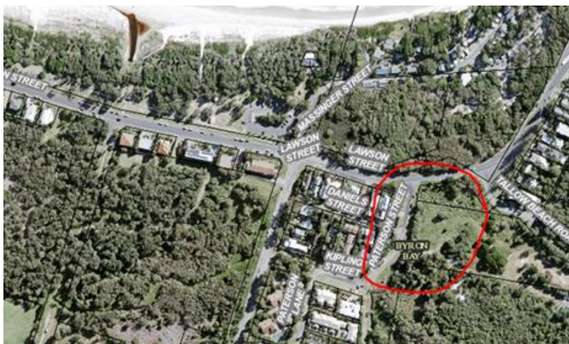
Figure 1. Paterson St locality plan