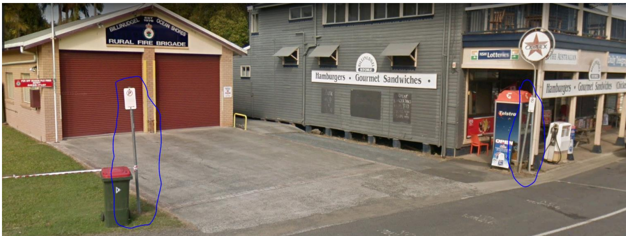
Figure 8 Wilfred St, street view