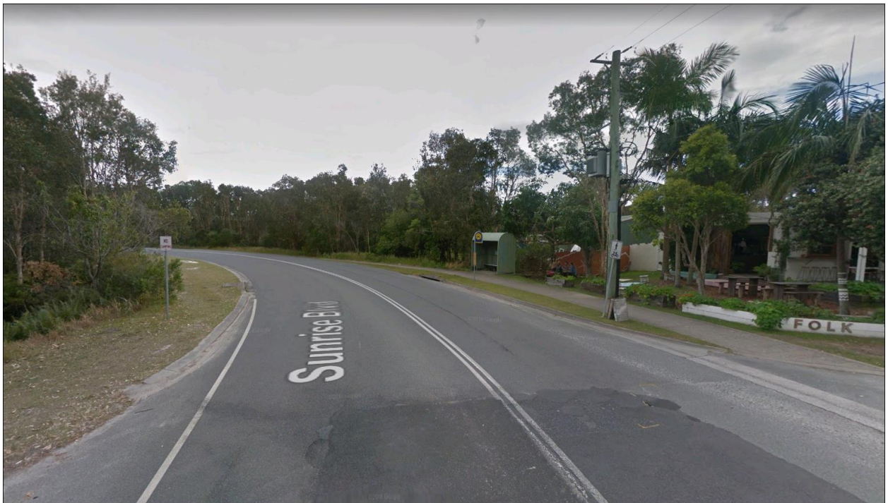
Figure 11. Sunrise Blvd, street view from entry of caravan park looking north

Member Boulton commented that this location (Sunrise Blvd) is where a yellow line could be useful.