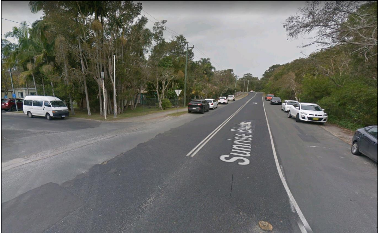
Figure 10. Sunrise Blvd, street view from entry to caravan park looking south to Ewingsdale Rd