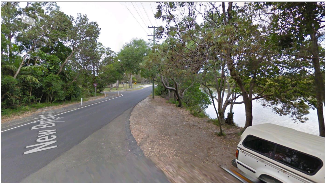
Figure 5. Casons Rd street view