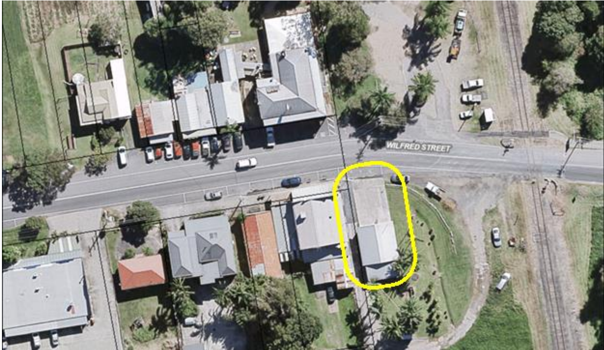
Figure 7. Wilfred St, locality view