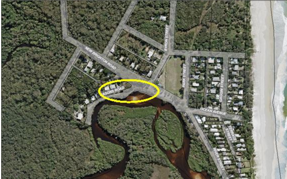
Figure 4. Cason's Rd locality plan