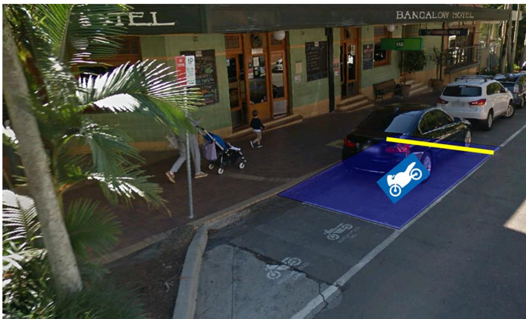
Figure 2: proposed motorcycle parking and rubber stop.

As a result, it is recommended to convert one 1P car space in front of the Bangalow Hotel into motor cycle parking and install a rubber stop to prevent service vehicles using the space (refer to Figure 2 below for the location and figure 3 for an example of damage done to the awning). This will result in the loss of one 1P space.