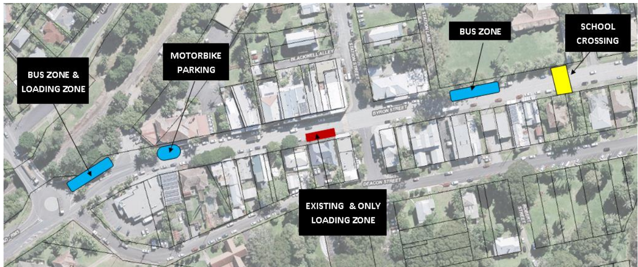
Figure 1: Locality plan of motorcycle parking and shared bus / loading zone