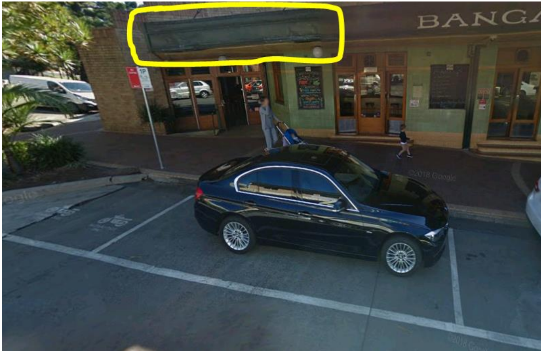
Figure 3: Photo illustrating the damage being done to the awning