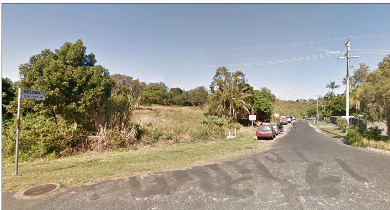
Figure 2. Paterson Street, street view