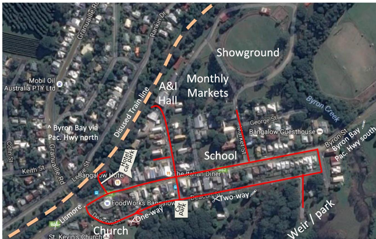
Figure 1: Bangalow parking management strategy study area

Council has been successful in managing demand for public car parking in the past, having introduced a pay parking system in the Byron Bay town centre and Marine Parade in Wategos Beach. Using a mix of time restrictions with an allowance for residential permits has been demonstrated in both of these projects to increase the turnover of visitors to the area, aiding in the number of vacant car parks available for use.