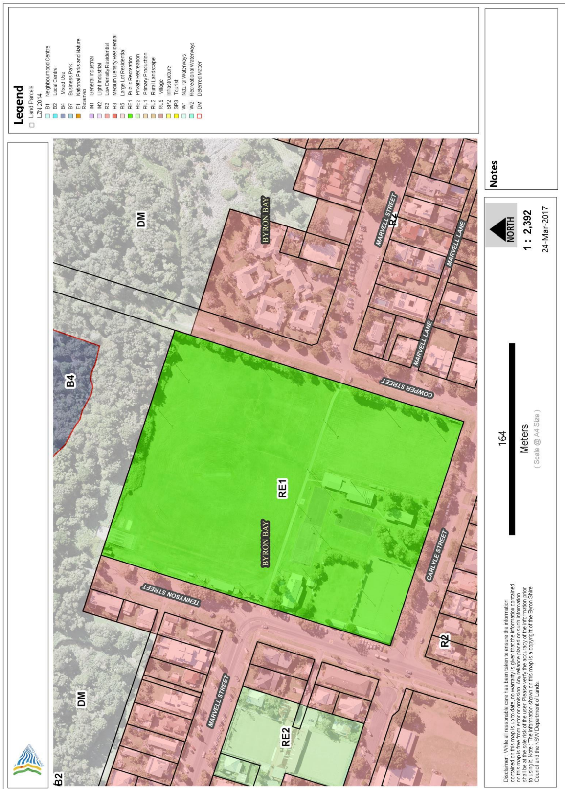
Figure 3: Byron Bay Recreation Ground - Zoning