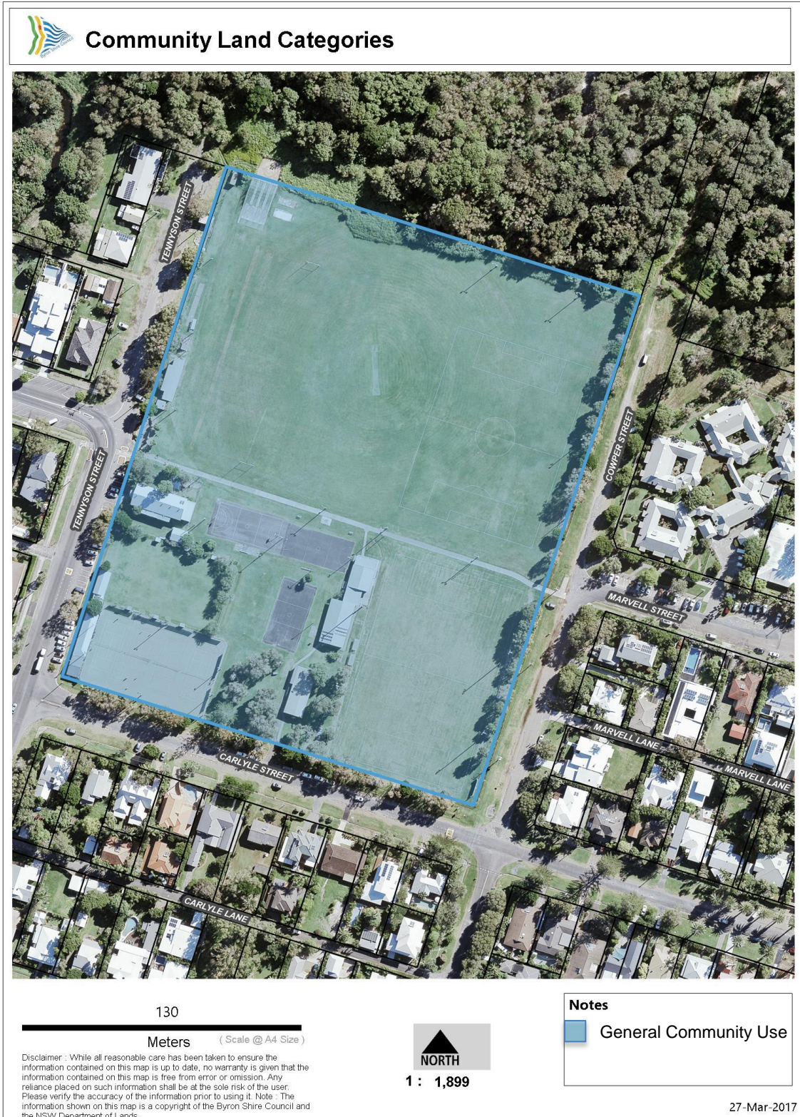
Figure 2: Land Categories

The Byron Bay Recreation Ground is classified as community land under the LGA. It is categorised as general community use .