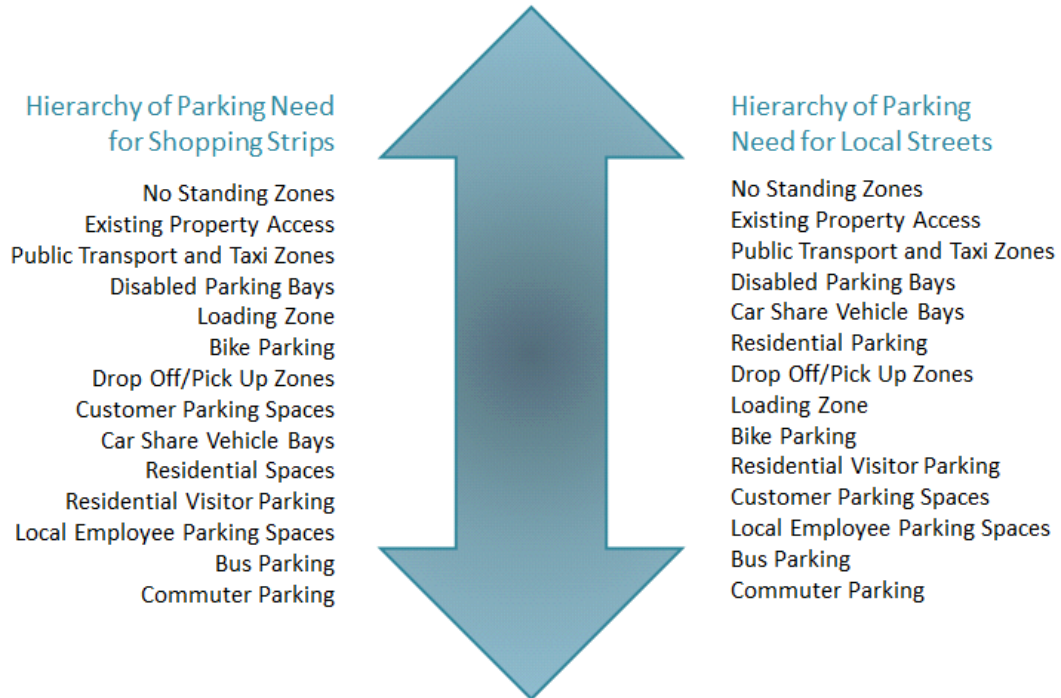
Figure 2: Hierarchy of Parking Need