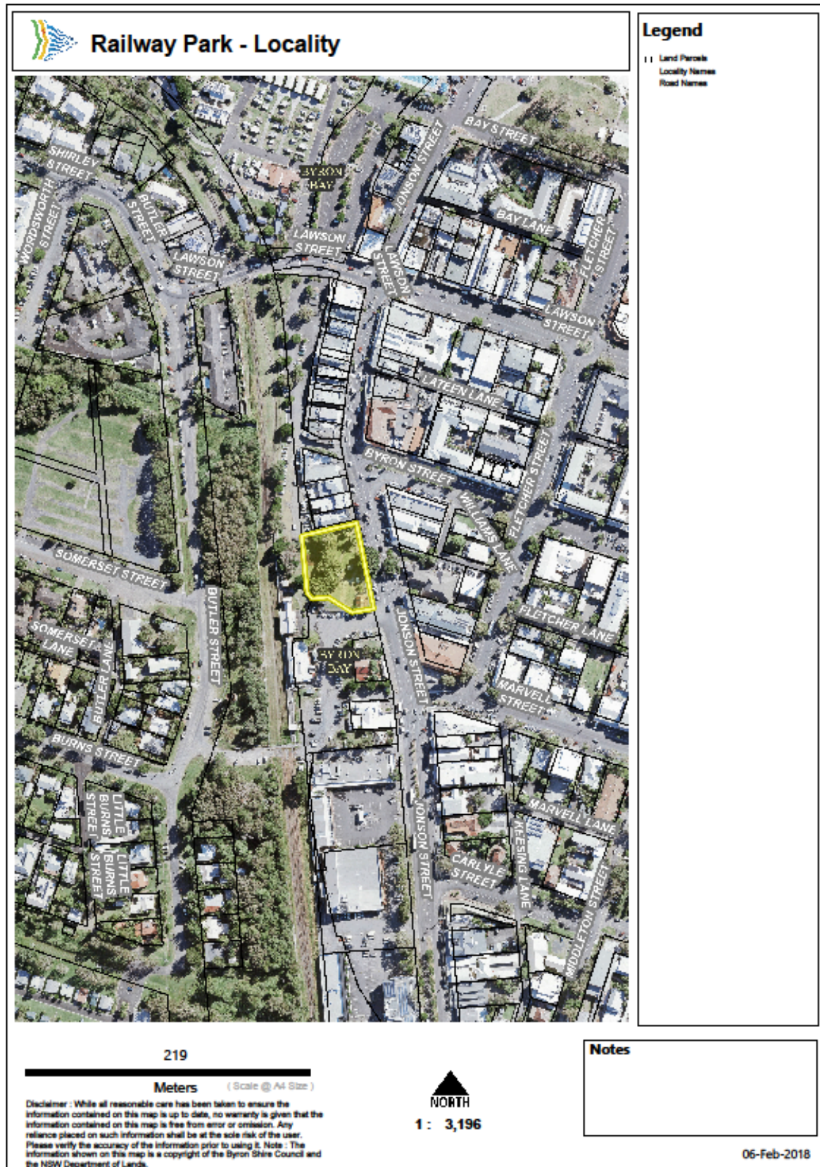
Figure 1: Railway Park - Locality