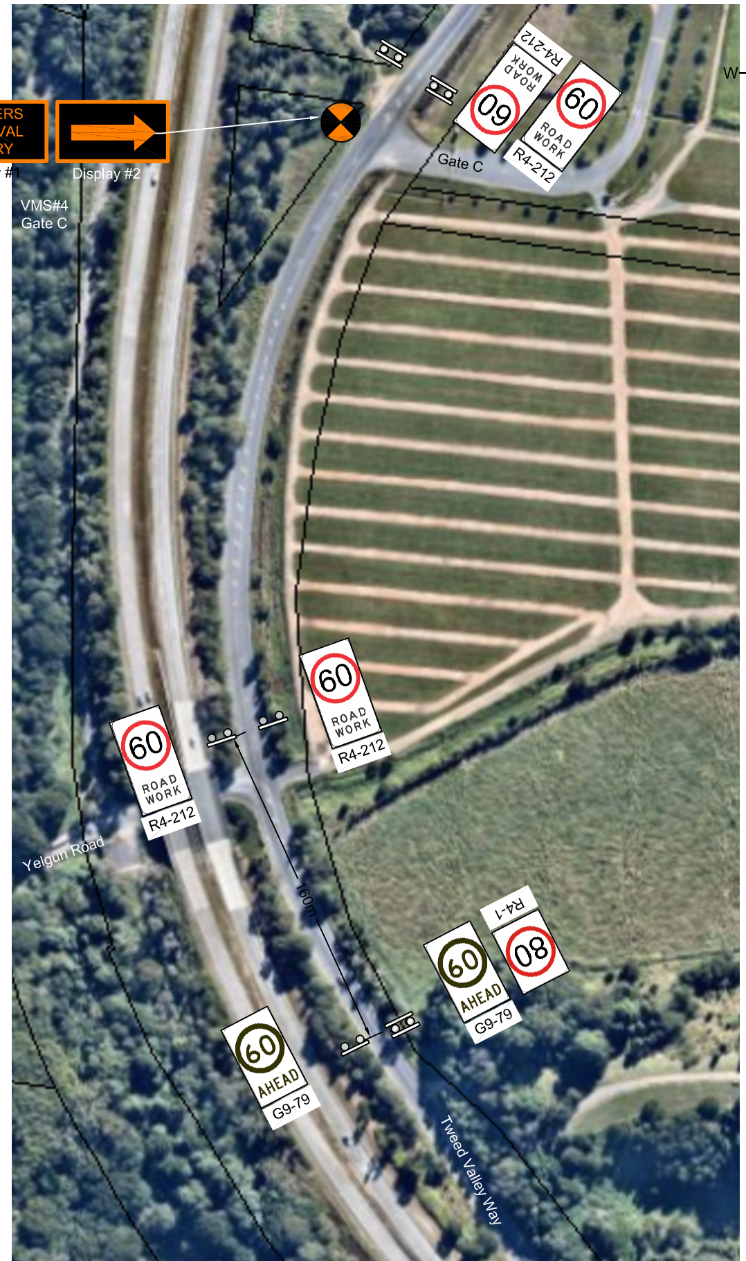
SOUTH APPROACH 1:2,500