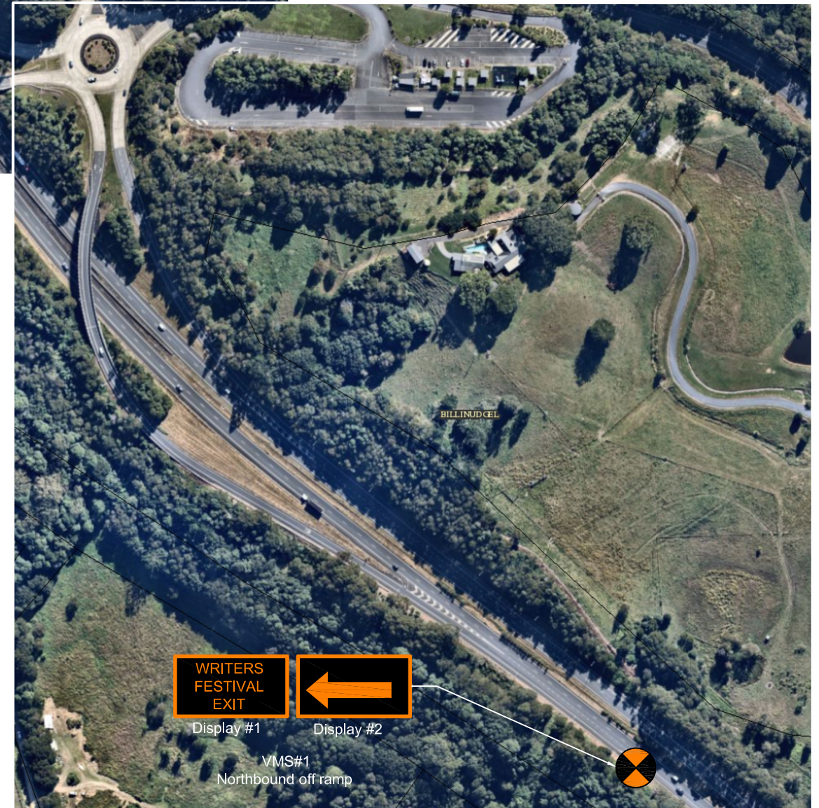
YELGUN INTERCHANGE N.T.S.