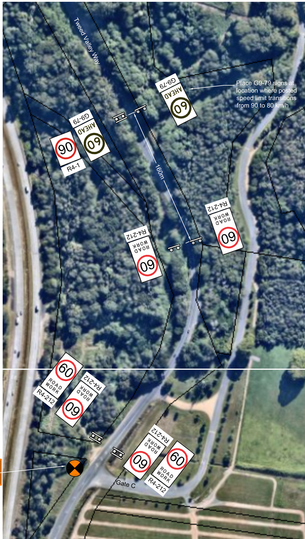
NORTH APPROACH 1:2,500