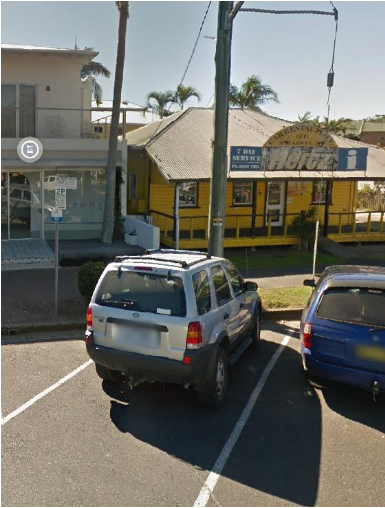
3/5 Marvel Street, Byron Bay