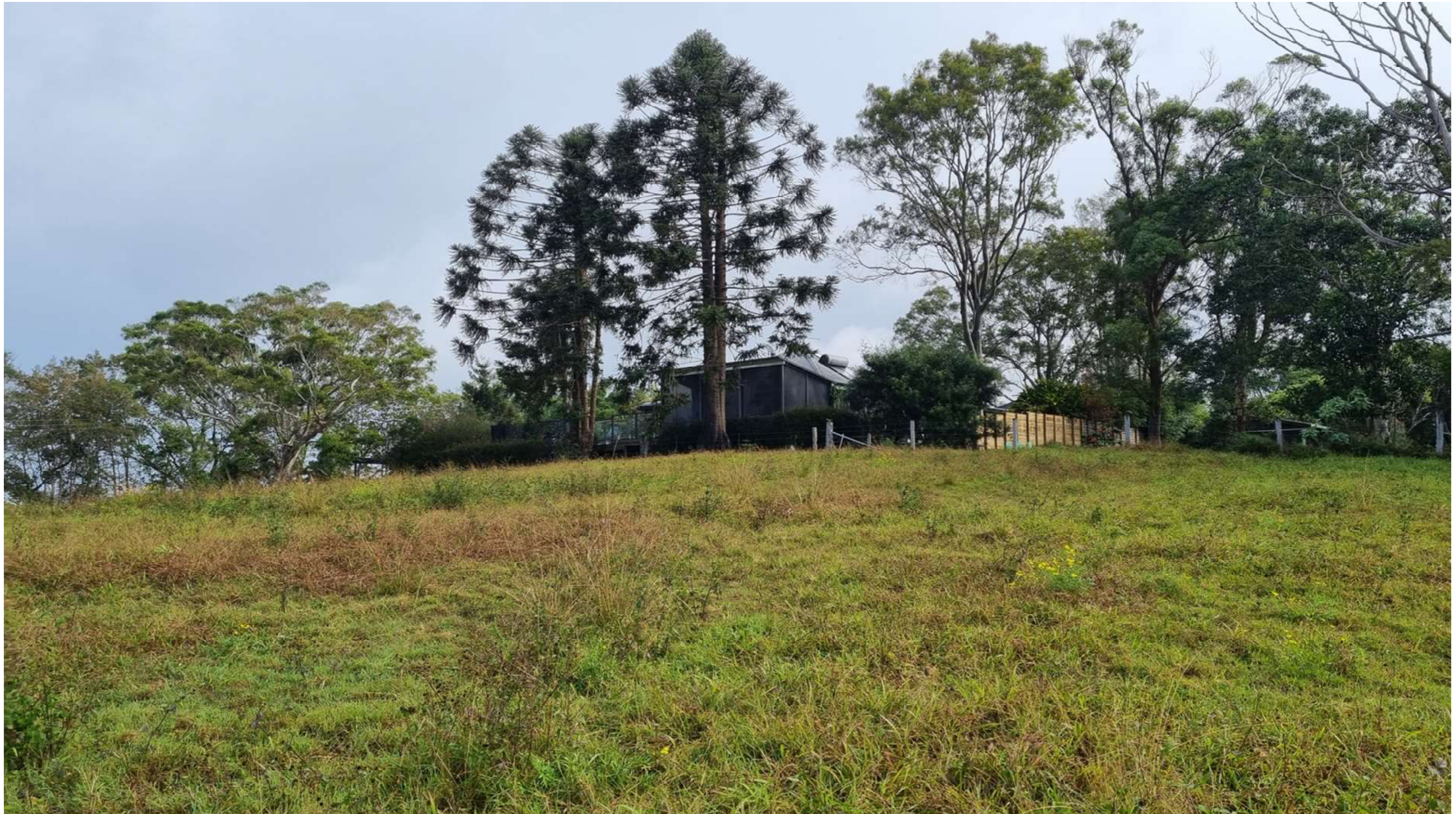
View of dwelling within 398 Coopers Shoot Road from the centre of Lot 1