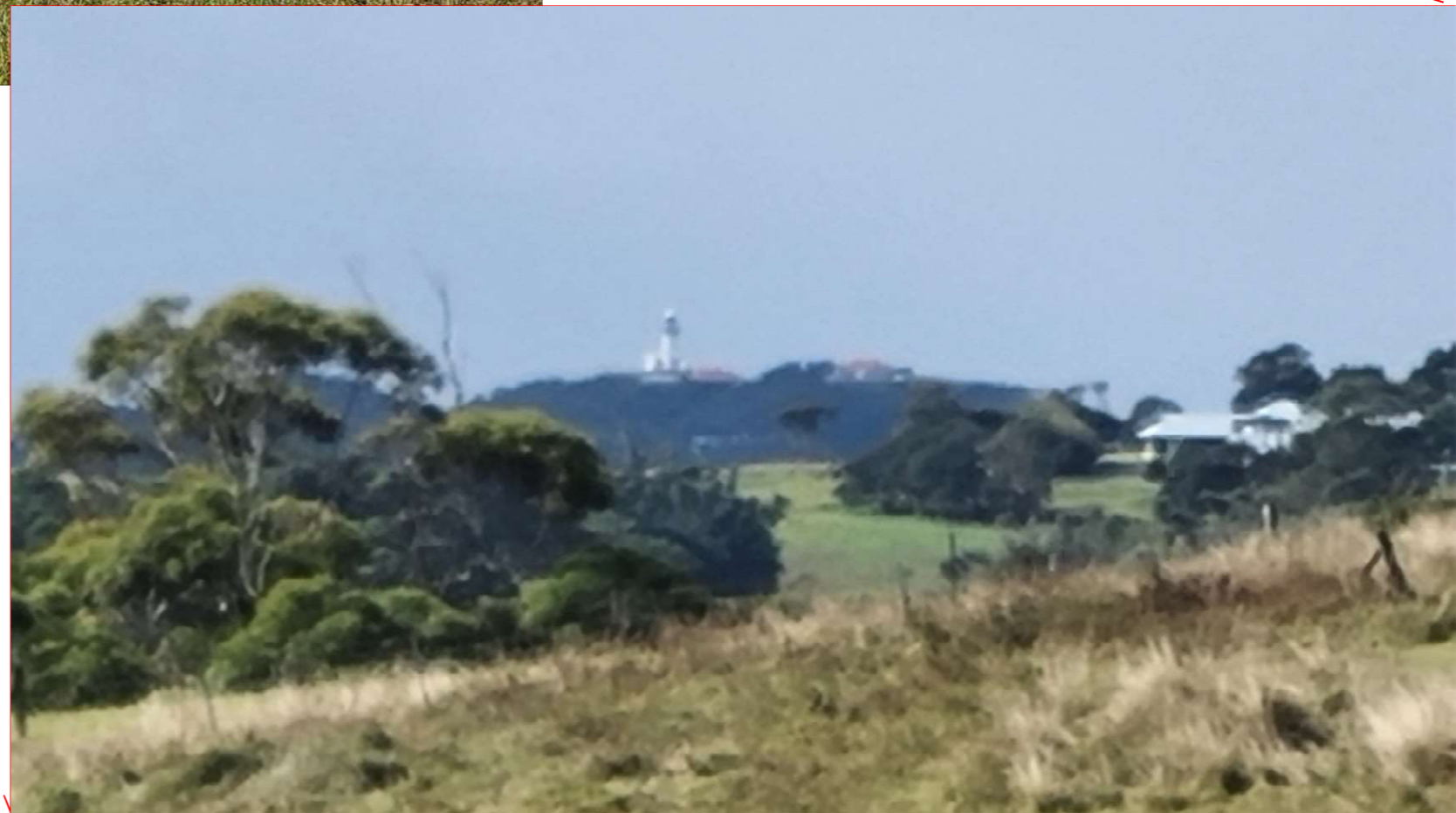
Zoomed view towards lighthouse from Lot 1