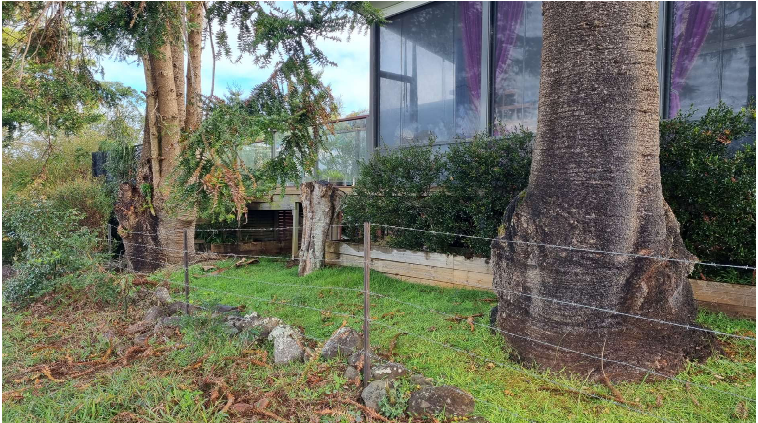
Image showing the floor level of the dwelling within 398 Coopers Shoot Road raised approximately 1200mm above ground level