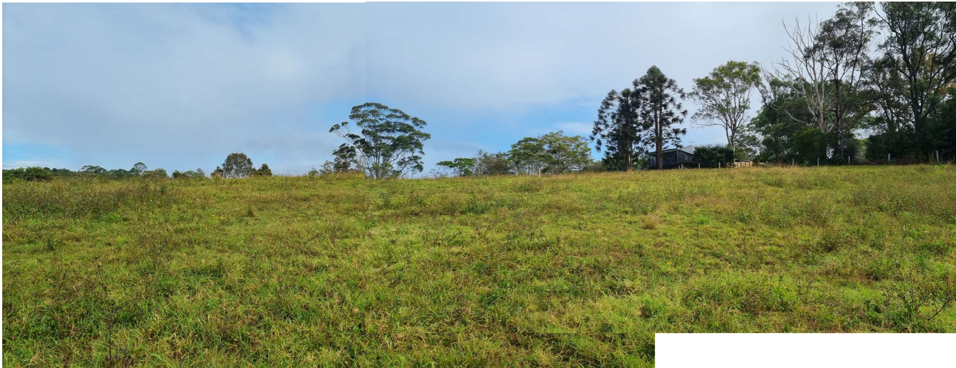
View from the centre of Lot 1 looking south-west