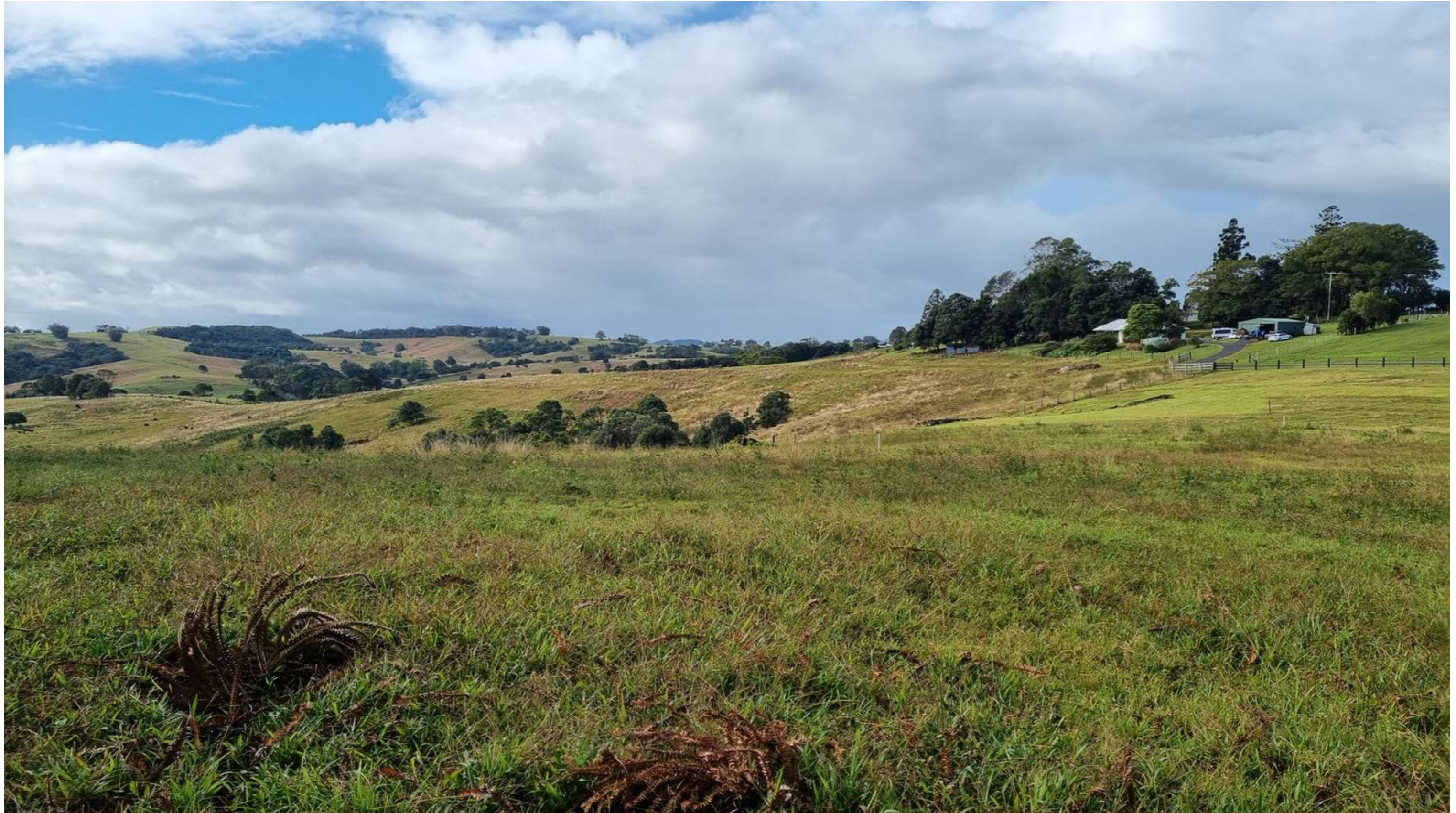
View towards lighthouse from lower slopes of Lot 1