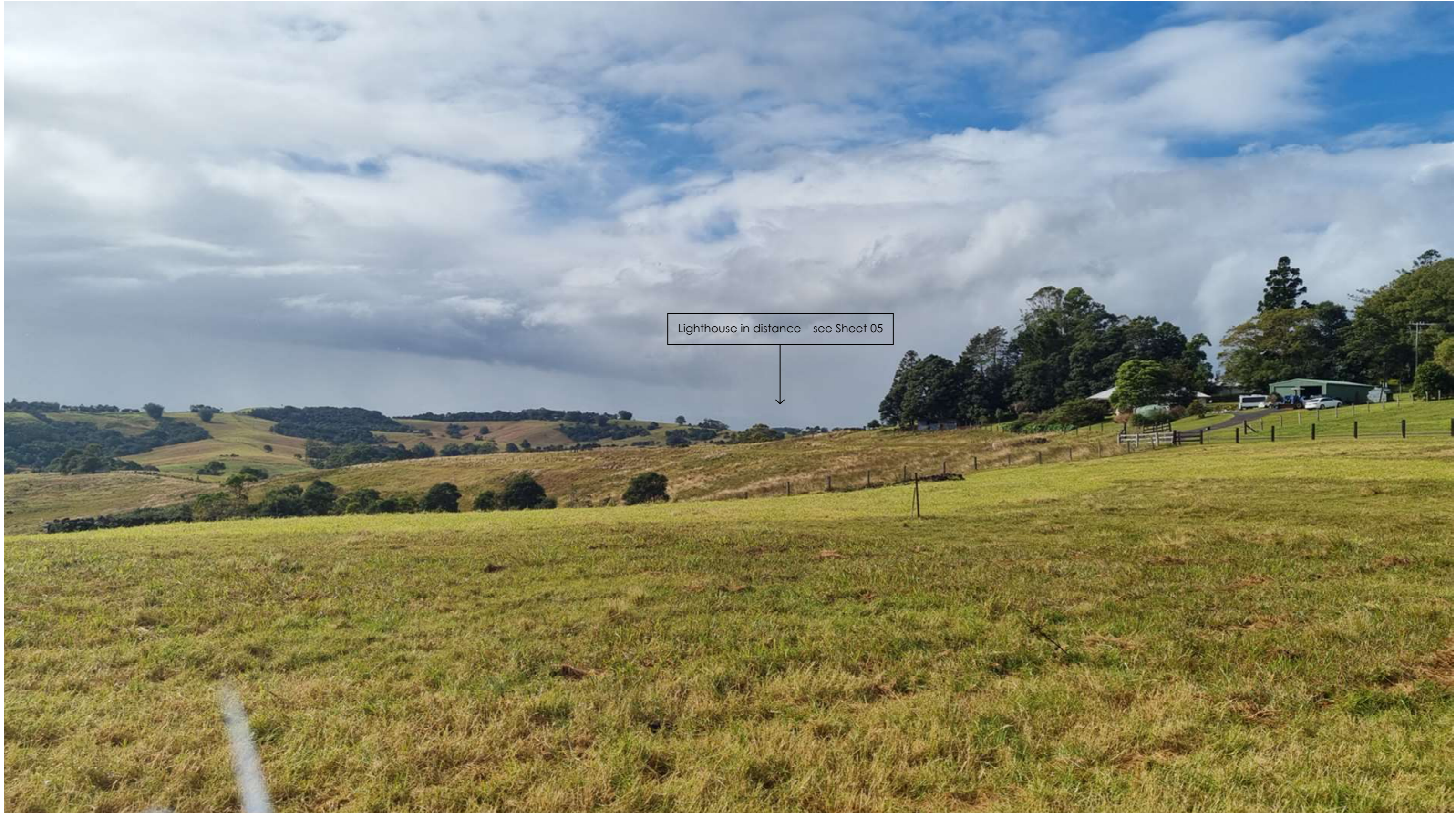
View towards lighthouse from Lot 1