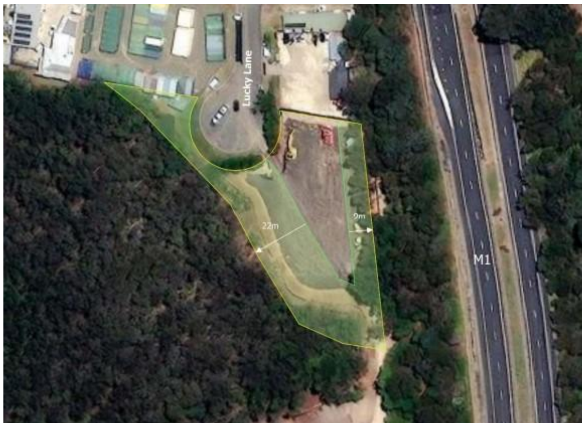
Figure 1: Plan of Site

Part of this Lot, an area 2,541m 2 has a current approval as a truck depot. The land has been filled to provide a flood free site.