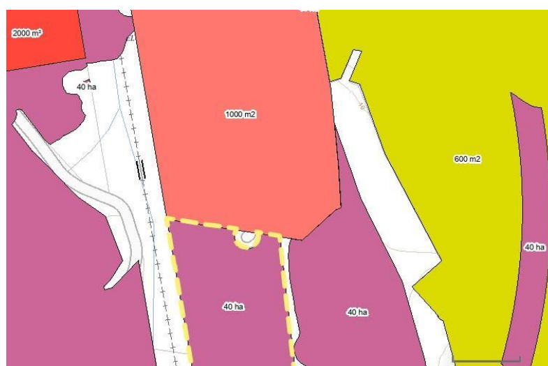
Figure 2: Current Lot Size Map

The Lot Size Map LSZ_002CA will be amended to allow for the subdivision of the land for General Industrial. The adjacent lot size for the Billinudgel Industrial Estate is 1,000m 2 (= 1,000m 2 minimum). Proposed Lot Size Map is Annexure 3.