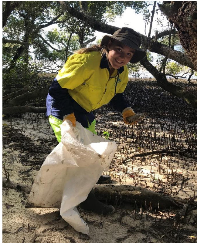
Photos of recent Brunswick River clean-up

A similar land-based program is currently underway to remove flood debris in public managed land within the catchments.