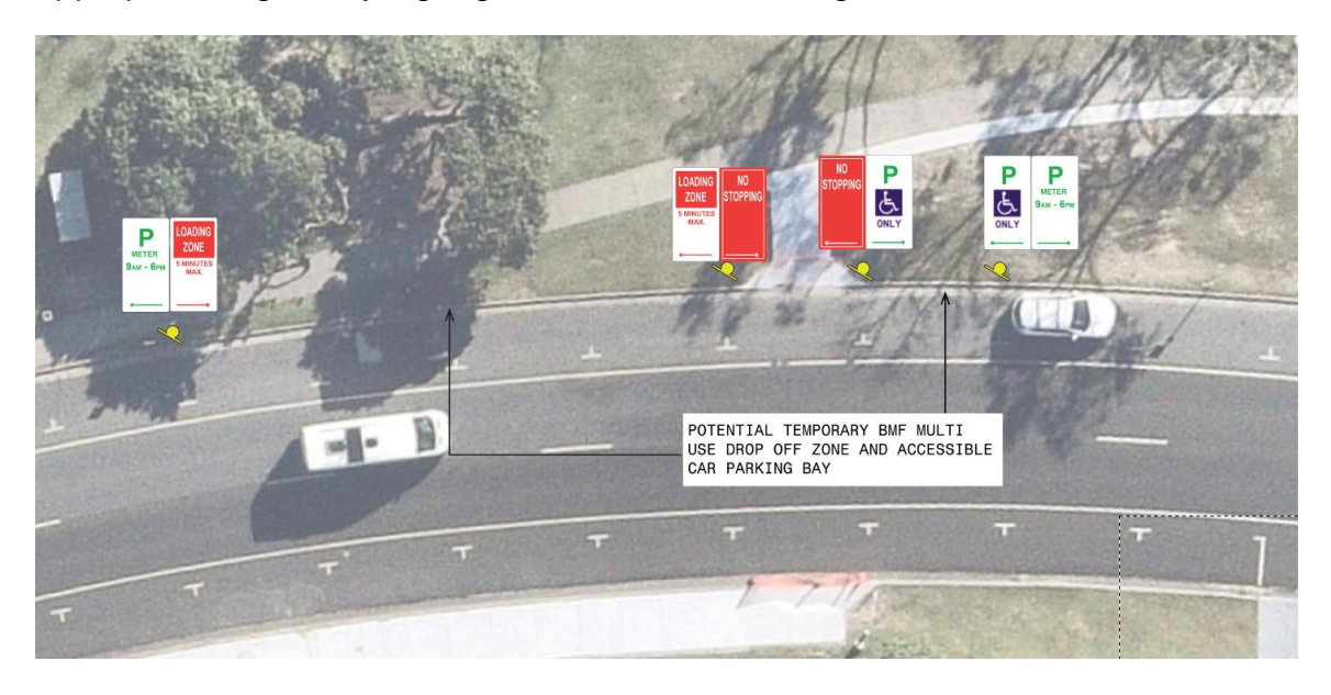
Figure 3 – Temporary accessible set down drop-off area and accessible parking space Opposite 38-40 Lawson Street Byron Bay

The attached TGS need some amendments in relation to the provision of a temporary set down/ drop-off area in Lawson street for patrons and the provision of a temporary accessible car parking space in Lawson Street. The plan also needs to include the appropriate regulatory signage as shown in the image below.