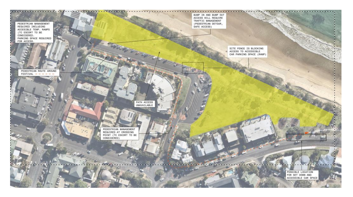
Figure 4 - Recommended Changes for Pedestrian management in Bay and Middleton Street

The TGS also needs to clearly delineate pedestrian management in Bay and Middleton to show the pedestrian thoroughfare around the site with traffic control escort as required for the two crossing points. Figure 4 above indicates the likely pedestrian thoroughfare and crossing points whilst the event is on.