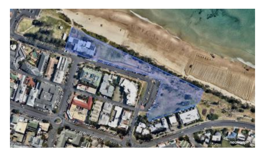
Figure 1 - Locality

The purpose of this report is to seek Local Traffic Committee support for the regulation of traffic for the Byron Music Festival 2023. Byron Music Festival (BMF) is proposed to be held in Dening Park and Byron Surf Club from the 17<sup>th</sup> June 2023. Bump in will occur on the 16<sup>th</sup> of June between 12pm-5pm and bump out on Sunday the 18<sup>th</sup> of June between 8am-12pm.