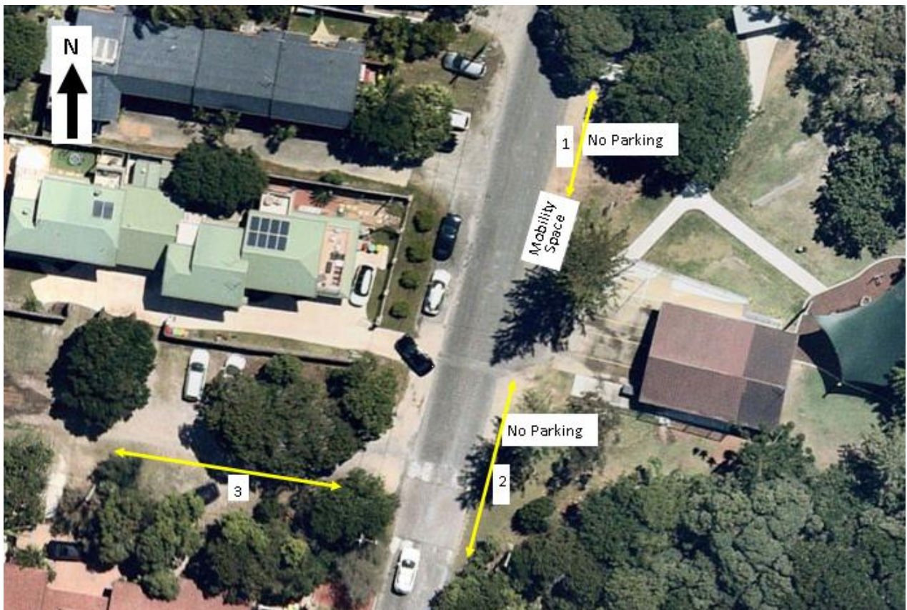
Figure 1 – existing parking restrictions.

Currently, RFS crews attending a call out park in the No Parking areas and in location 3. RFS members have a RFS sticker on their windscreen and Council Enforcement Officers have an informal agreement to not fine cars with these stickers. It is noted the Council enforcement team does not visit this area frequently as it is not a problem spot.