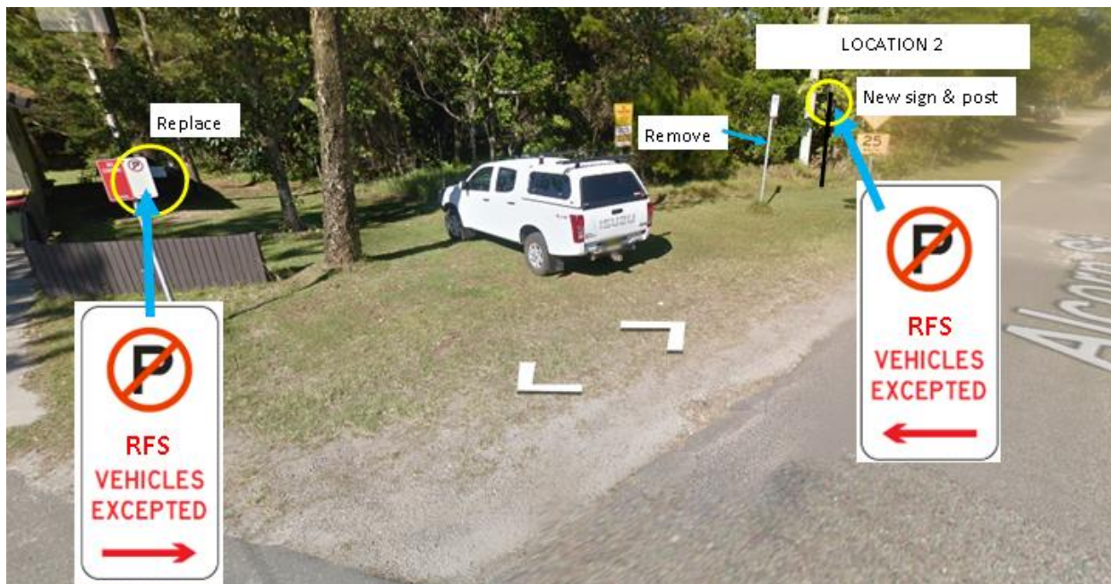
Figure 2 – proposed signage for Area 2.

15 Therefore, it is proposed to change only Area 2 from No Parking to No Parking RFS Vehicles Exempt.