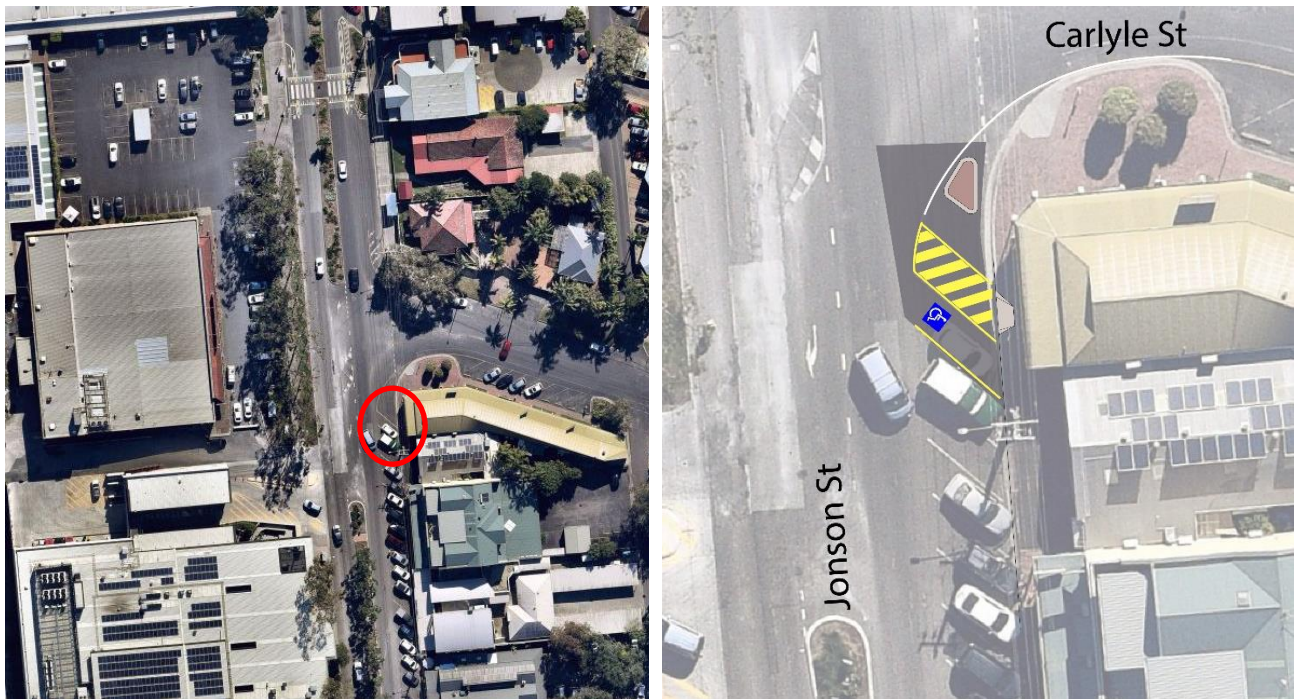
Figure 2: Proposed accessible bay location (Left), Bay design concept only (right)