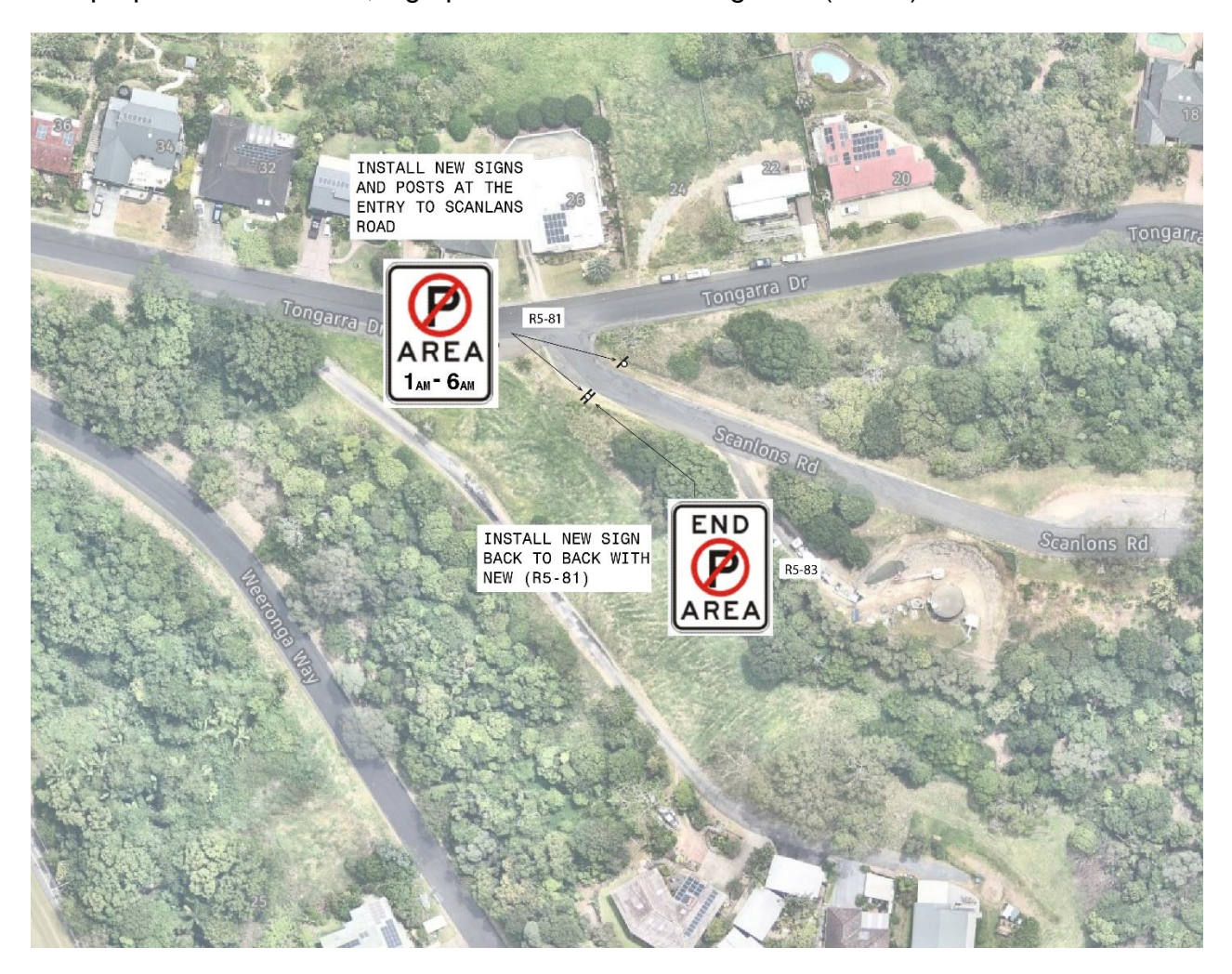
Figure 1: Devine Hill no parking signage plan

The proposed restrictions, sign plan is shown in the figure 1 (below)