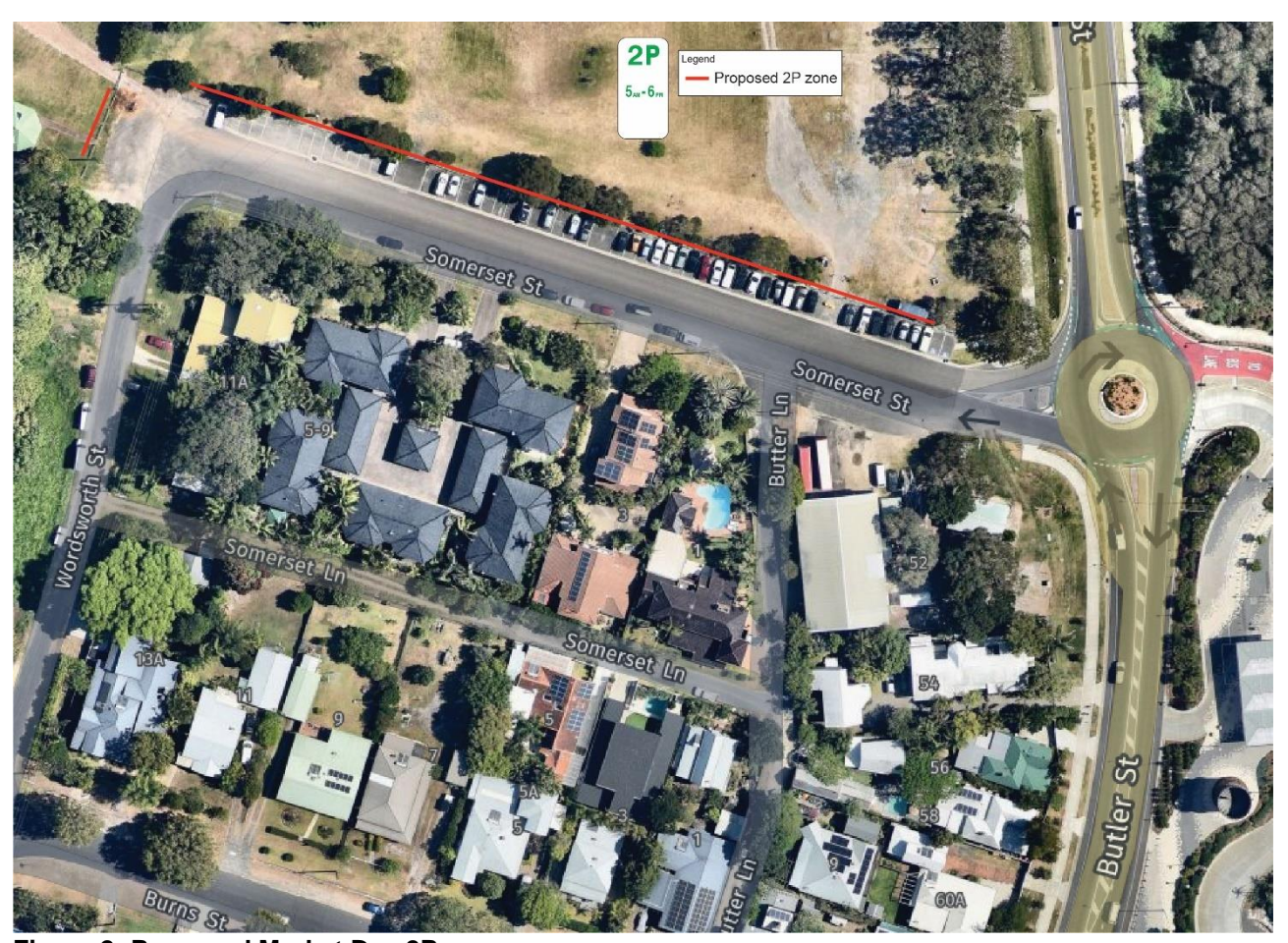
Figure 2: Proposed Market Day 2P area