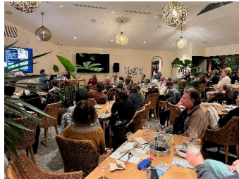
Science in the Pub