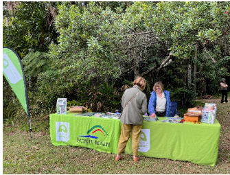
Stall at Federal Family Fun Day