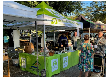
Mullumbimby Farmers Market