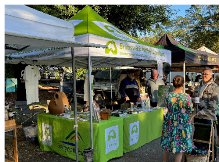
Mullum Farmers Market