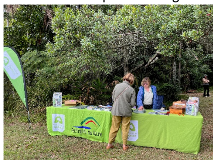
Stall at Federal Family Fun Day