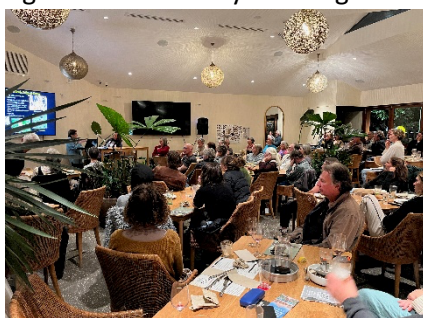
Science in the Pub