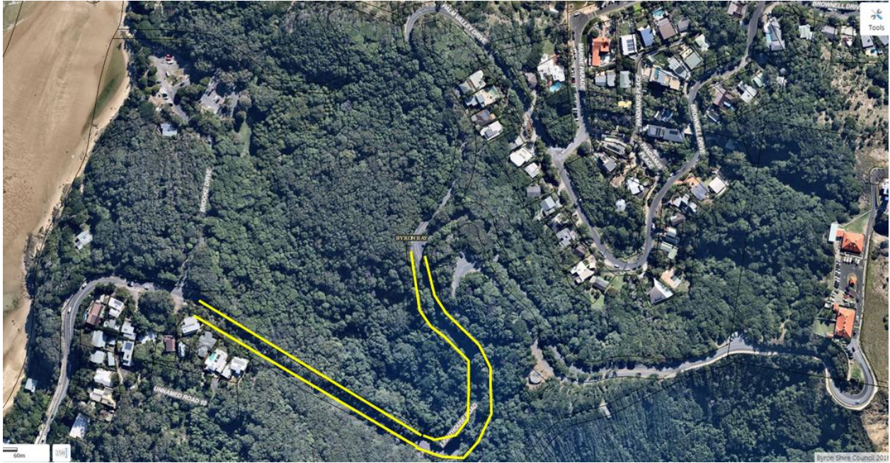
Figure 1 – location of requested yellow lines.

EXTRAORDINARY LOCAL TRAFFIC COMMITTEE MEETING MINUTES 8 DECEMBER 2020