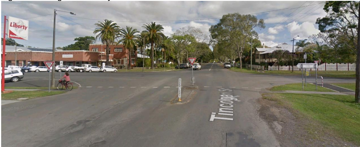
Figure 1: Tincogan St / Dalley St Intersection

Figure 2 below shows the typical traffic paths through Mullumbimby. Refer to blue line for vehicles travelling east / west and yellow for vehicles traveling south / west.