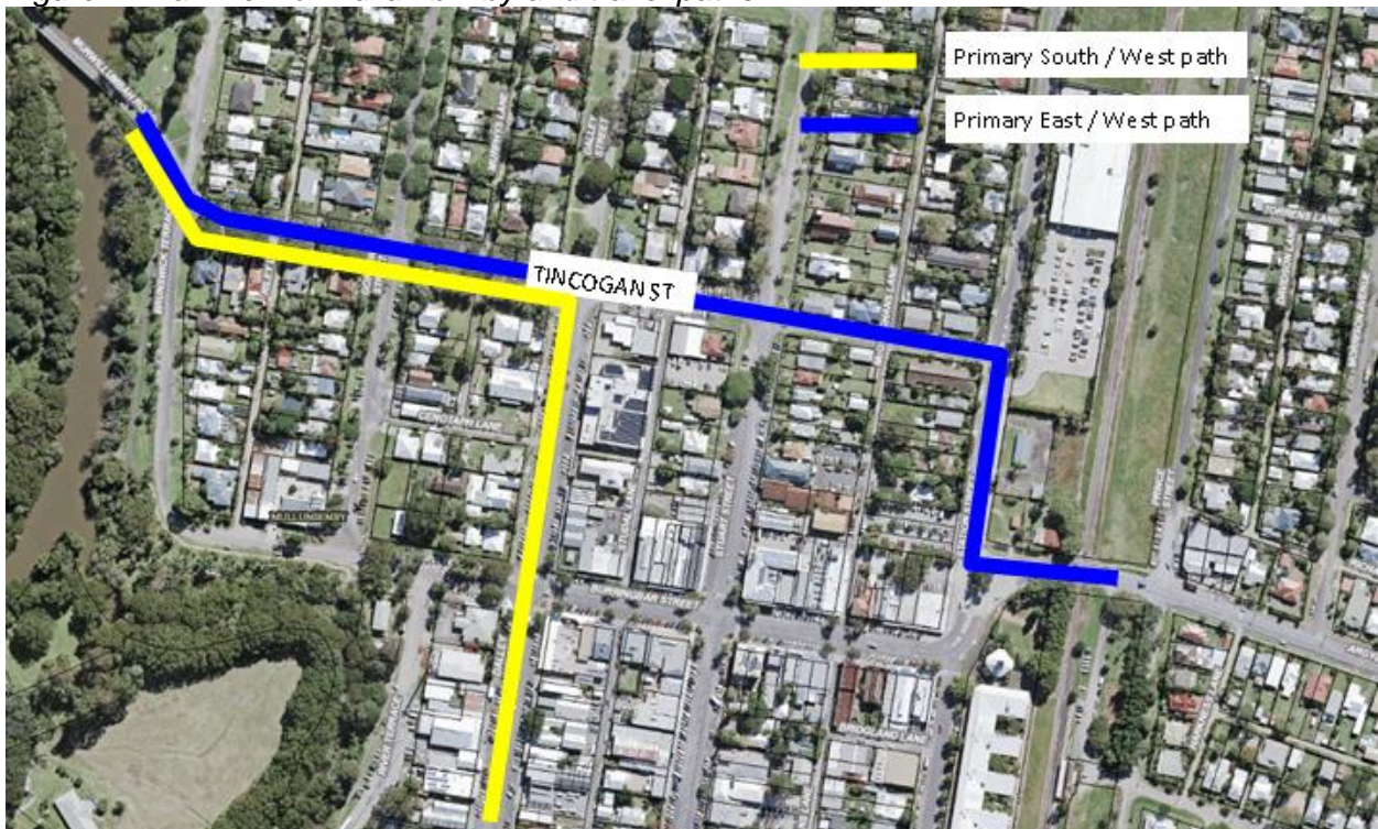
Figure 2: Plan view of Mullumbimby and travel paths

Figure 2 below shows the typical traffic paths through Mullumbimby. Refer to blue line for vehicles travelling east / west and yellow for vehicles traveling south / west.