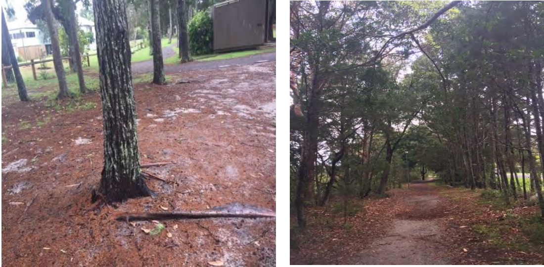
Figure 8 and Figure 92. Partial natural mulching around trees situated at the south western corner, around Trees 2–8 of Terrace Holiday Park along with an example of natural mulching around Callitris trees in Simpsons Reserve.