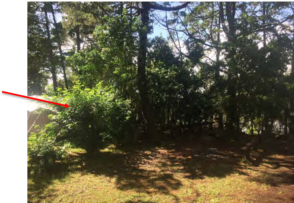
Figure 7. The red arrow indicates a planting of exotic Murraya paniculata not a species associated with CCPF recommended for removal.