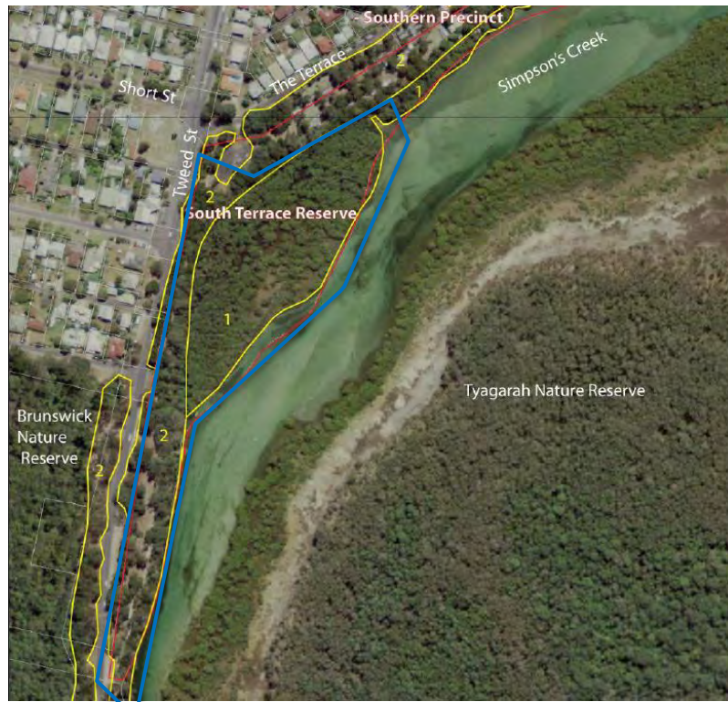
Figure 12. Depicts the location of CCPF within Simpson Reserve with a Blue line. This area appears to be suitable and appropriate for regeneration. Site use should be restricted to activities that will regenerate the EEC. Source: VPM 2011