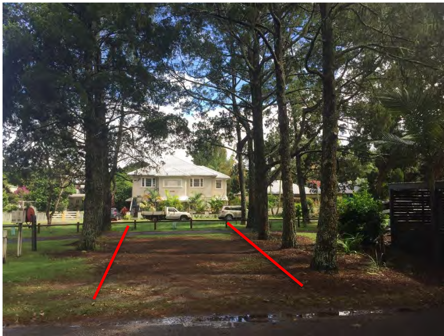
Figure 6. The photo shows site 22 (refer to Fig. 4) as an example of where load cells (between red lines) could be utilised to allow access and use of site when SRZ encroachment is unavoidable. The long narrow site could be designated for camper trailer use with awning out to the left.