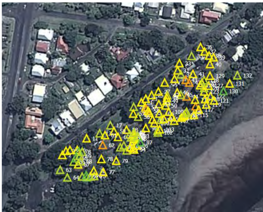
Figure 2. Aerial image showing icons representing the existing trees situated within the Terrace Holiday Park Southern Precinct. ArborSite, March 2018.

5.5.2 The majority of trees situated within the precinct, excluding the mangroves bordering Simpson Creek, are included within the ArborSite annual inspections which have been conducted annually since 2013.