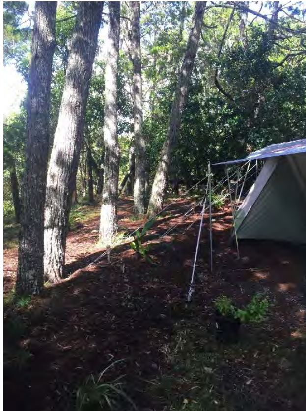
Figure 5. The photo shows encroachment from an awning into a protected regeneration area due to lack of space and inappropriate site booking.