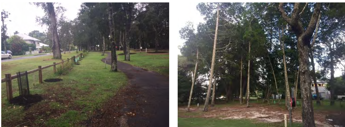
Figure 10 and Figure 11. Potential planting/regeneration areas within the southern zone. Left: The western Right: area in the south western corner around Trees 2–8.