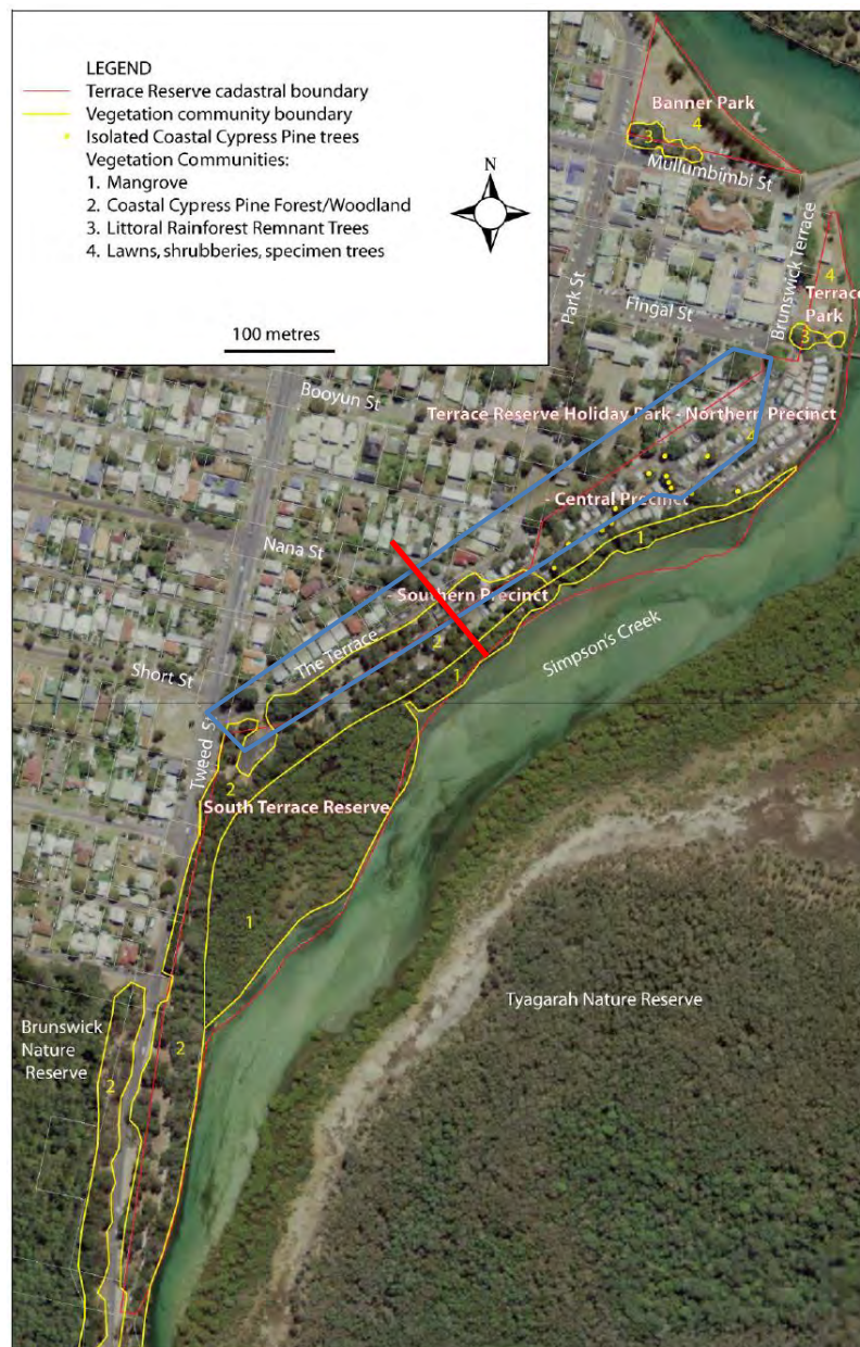
Figure 1. The blue outline depicts the entire Terrace Holiday Park site. The Southern Precinct, as relating to this report, extends within the blue outline to the south of the red line.