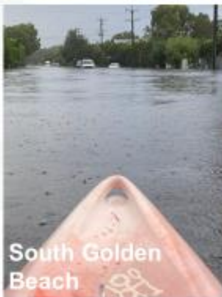
South Golden Beach