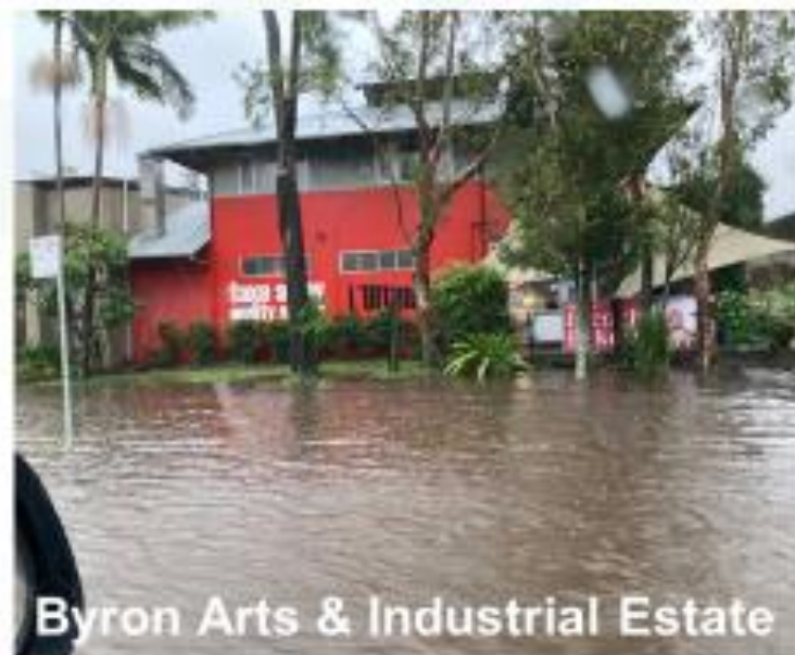
Byron Arts & Industrial Estate