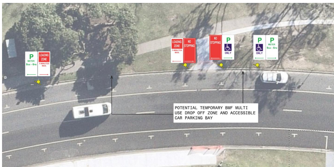
Figure 3 – Temporary accessible set down drop-off area and accessible parking space Opposite 38-40 Lawson Street Byron Bay

The attached TGS need some amendments in relation to the provision of a temporary set down/ drop-off area in Lawson street for patrons and the provision of a temporary accessible car parking space in Lawson Street. The plan also needs to include the appropriate regulatory signage as shown in the image below.