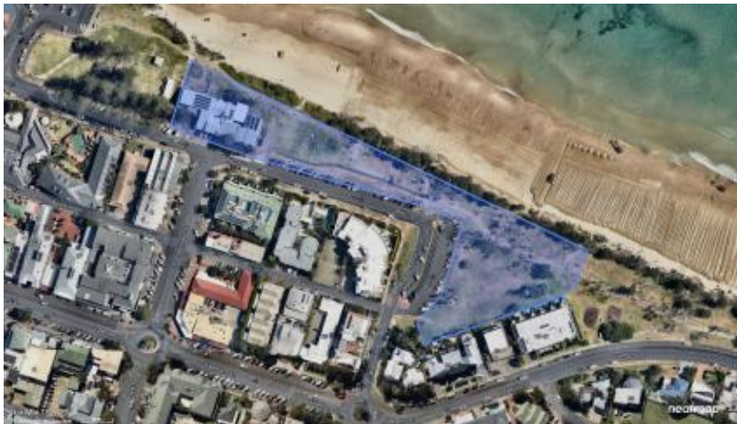
Figure 1 – Locality

The purpose of this report is to seek Local Traffic Committee support for the regulation of traffic for the Byron Music Festival 2023. Byron Music Festival (BMF) is proposed to be held in Denning Park and Byron Surf Club from the 17 th June 2023. Bump in will occur on the 16 th of June between 12pm-5pm and bump out on Sunday the 18 th of June between 8am-12pm.