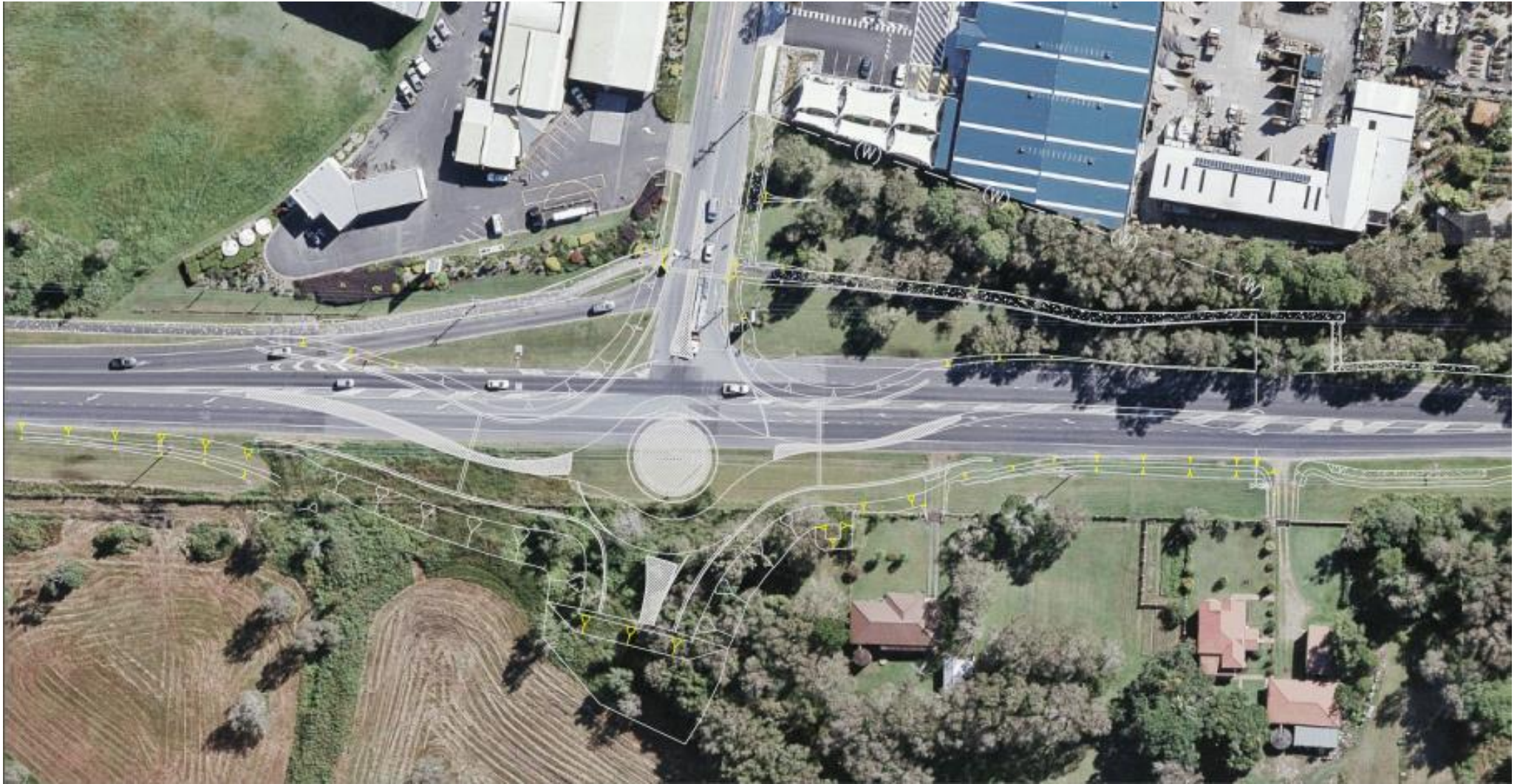
Plans for Proposed Roundabout