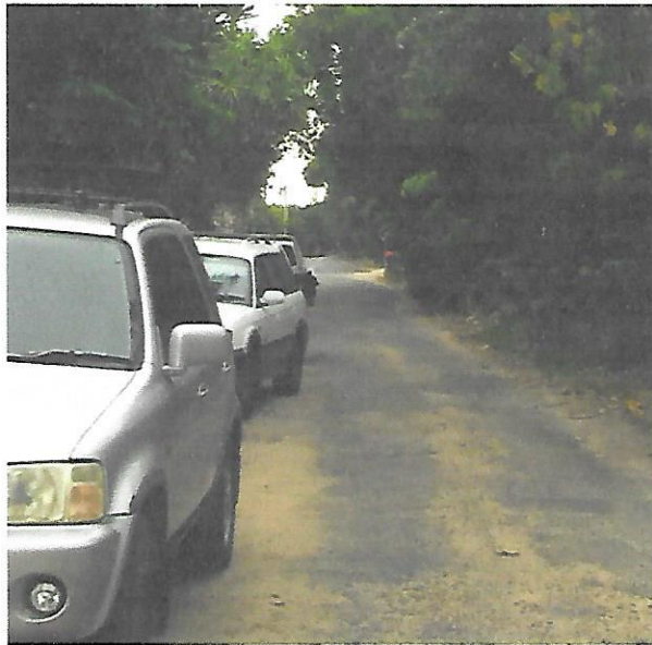
no room for two way traffic