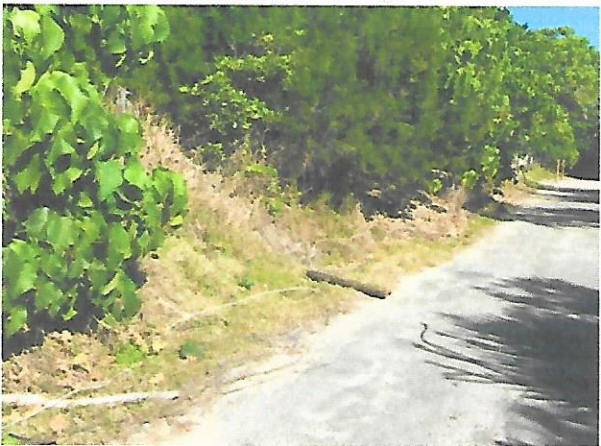
dune fencing and wires destroyed