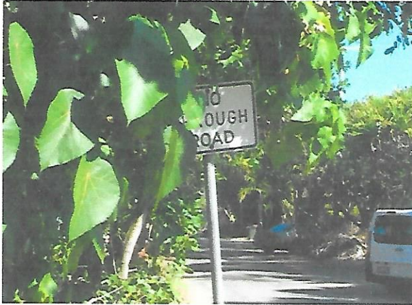
sign poorly positioned