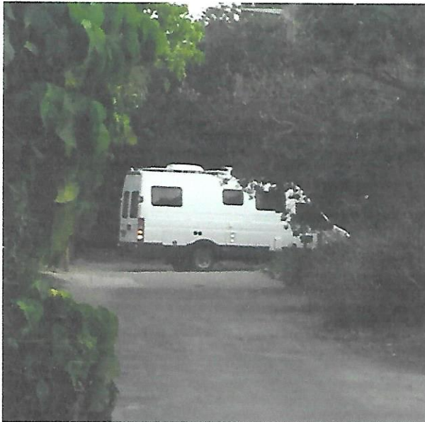
large vehicle attempting turn around