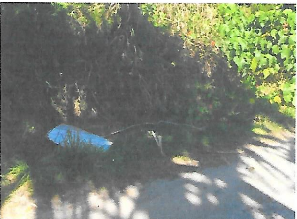
hazardous fencing and wires