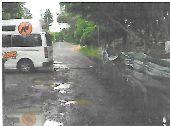
larger vehicle blocking laneway