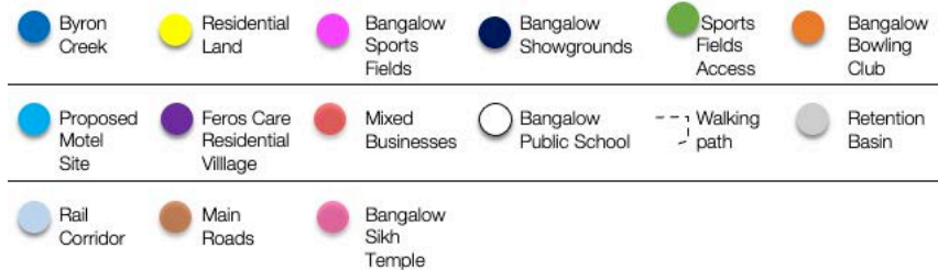
Figure 11. Bangalow Sports Fields and surrounding land uses