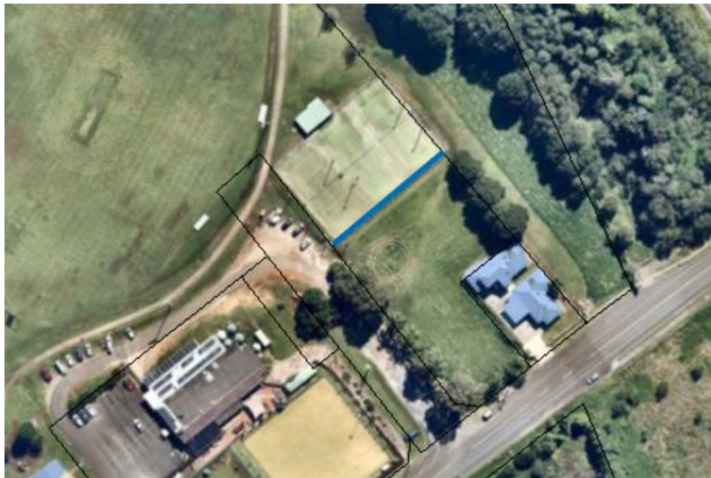
Figure 7. The boundary between the tennis courts and the proposed motel site (blue line)

The parcel of operational land (which provides access to the Sports Fields) extends into the field of play.