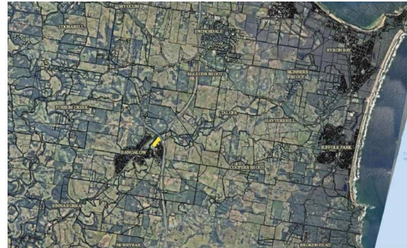
Figure 2. Bangalow Sports Fields (yellow) locational context