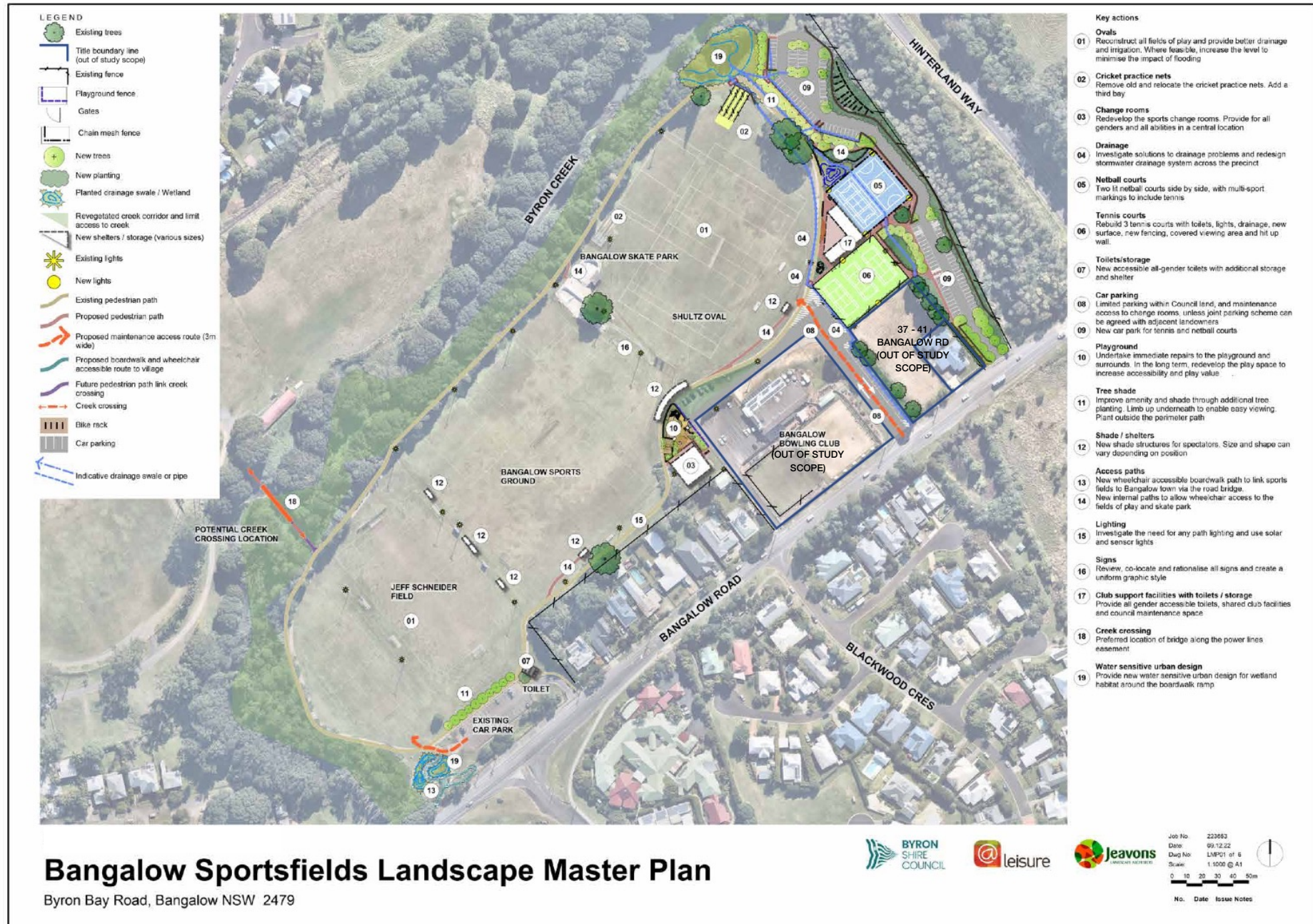
Figure 13. Landscape master plan