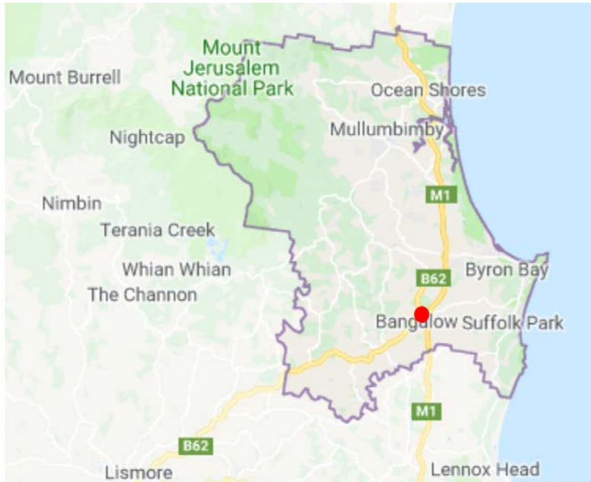
Figure 1. Location of Bangalow in the Shire. Image Google 2019

This Plan of Management relates to the land known as the Bangalow Sports Fields, situated in the south of the Shire at 5 Byron Bay Road, Bangalow 2479. See the following images.