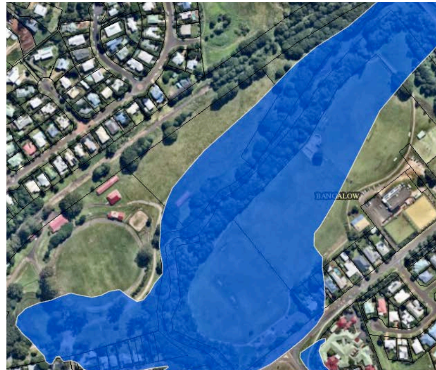
Figure 9. Bangalow Sports Fields Flood overlay

Maps showing the two planning overlays are provided below. The Bangalow Sports Fields has a flood zone overlay that covers most of the Sports Fields except for the south-eastern corner.