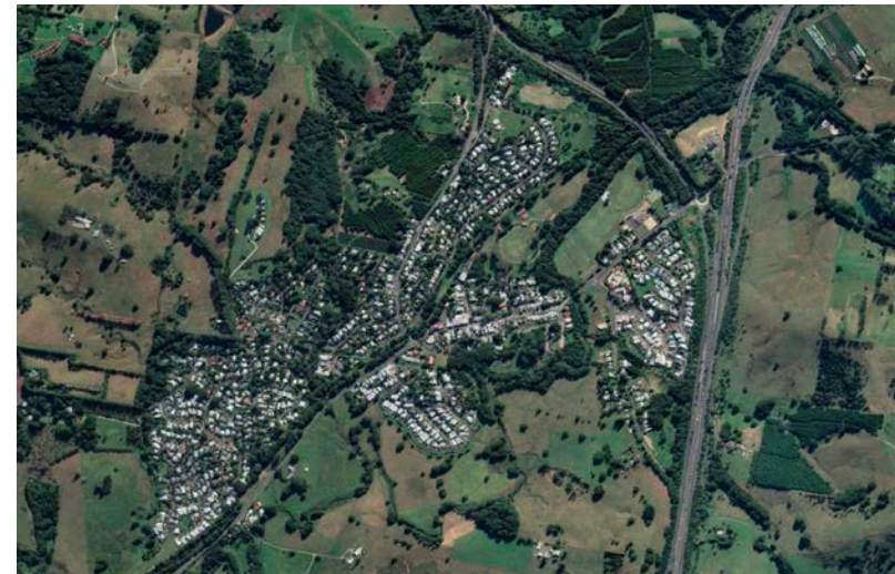
Figure 3. Location Bangalow Sports Fields