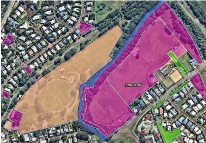
Figure 5. Individual parcels of Council and Crown land in and around the Bangalow Sporting Fields

Adjacent to the Bangalow Sports Fields is two parcels of Crown land. These are the Showgrounds (orange) and the Byron Creek (blue). See Figure following.