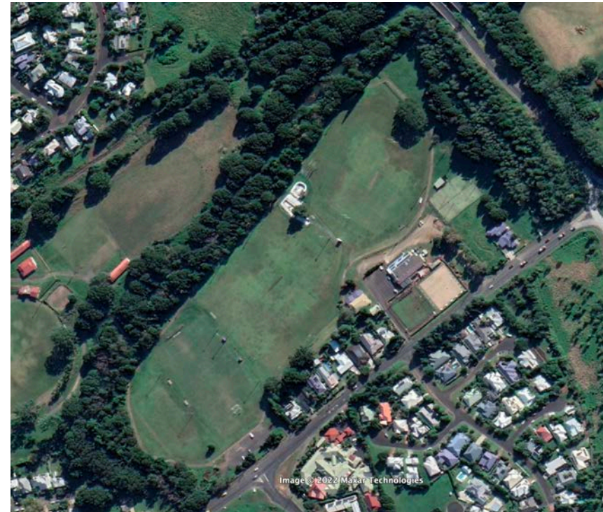
Figure 4. Aerial view of Bangalow Sports Fields

The Reserve includes a skate park, perimeter path, playgrounds and associated open green space and the revegetated area along the creek.