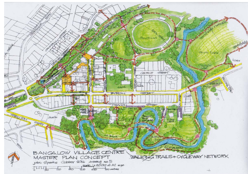
Figure 12. Walking Trail and Cycleway Network: Bangalow Village Centre Master Plan Concept

The following image shows the Walking Trail and Cycleway Network: Bangalow Village Centre Master Plan Concept.