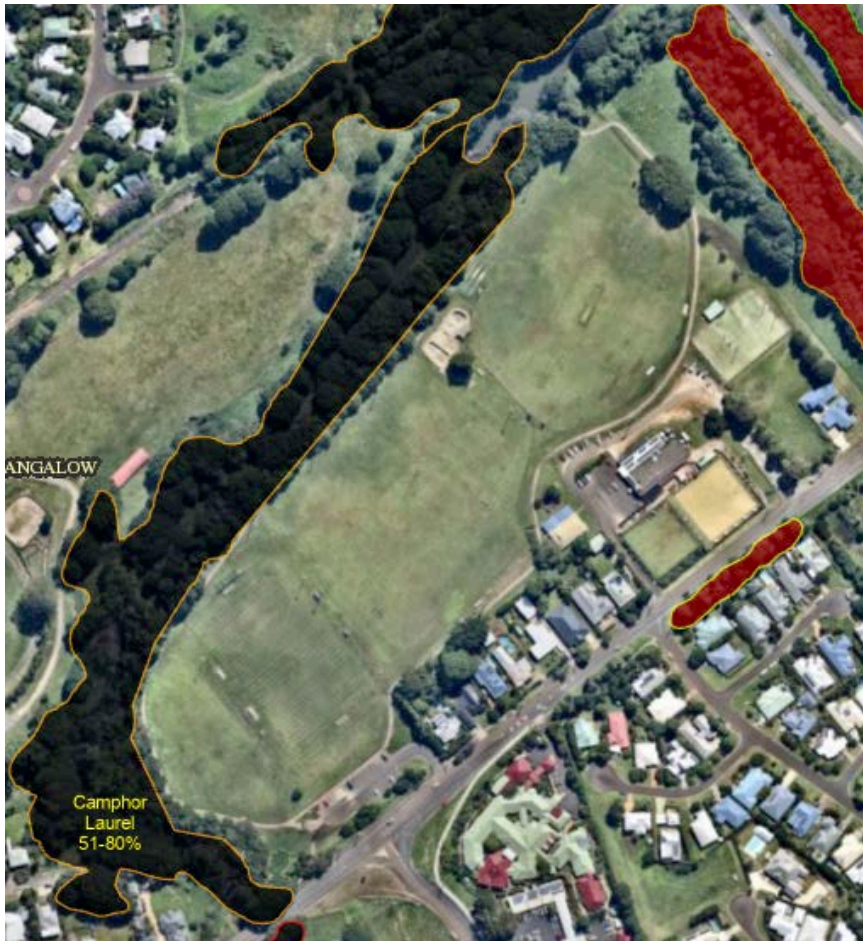
Figure 10. Bangalow Sports Fields Camphor Laurel overlay (yellow border)