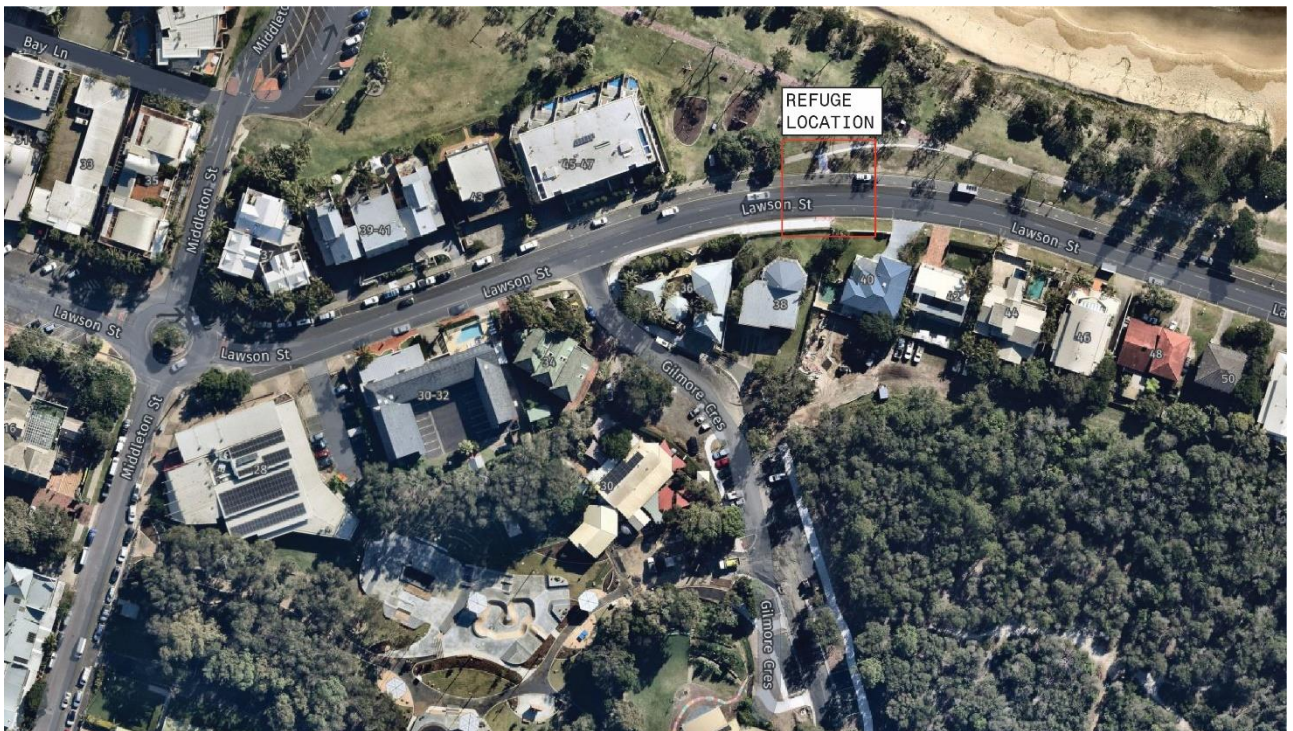
Figure 1: Locality map

There will also be provision for pedestrians (refuge) on Lawson Street for safe crossing and access to the new skate park (E2023/71557).