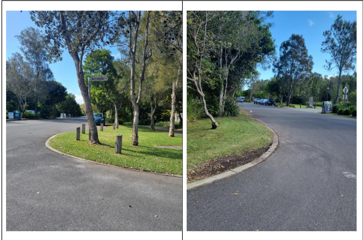
Figure 9 (above): Intersection sight distance (Bayshore Dr/Bayshore Ln, north)

Bayshore Lane is a low-speed, low volume environment; recent traffic survey data has indicated that the 85 percentile speeds are less than 30km/h. The direction of travel within the street is split 60/40 favouring the northbound direction (64 VPD).