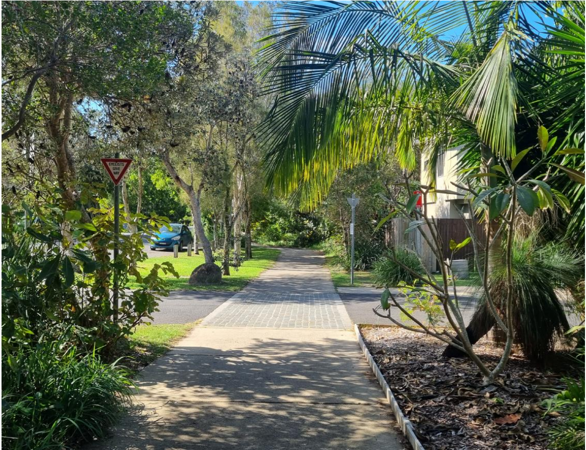
Figure 6 (above): Pedestrian Footpath Bayshore Dr on approach to Bayshore Ln