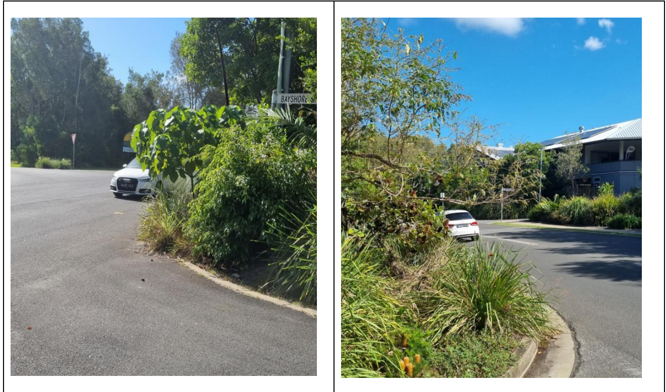
Figure 4 (above): Intersection sight distance (Bayshore Ln, South)