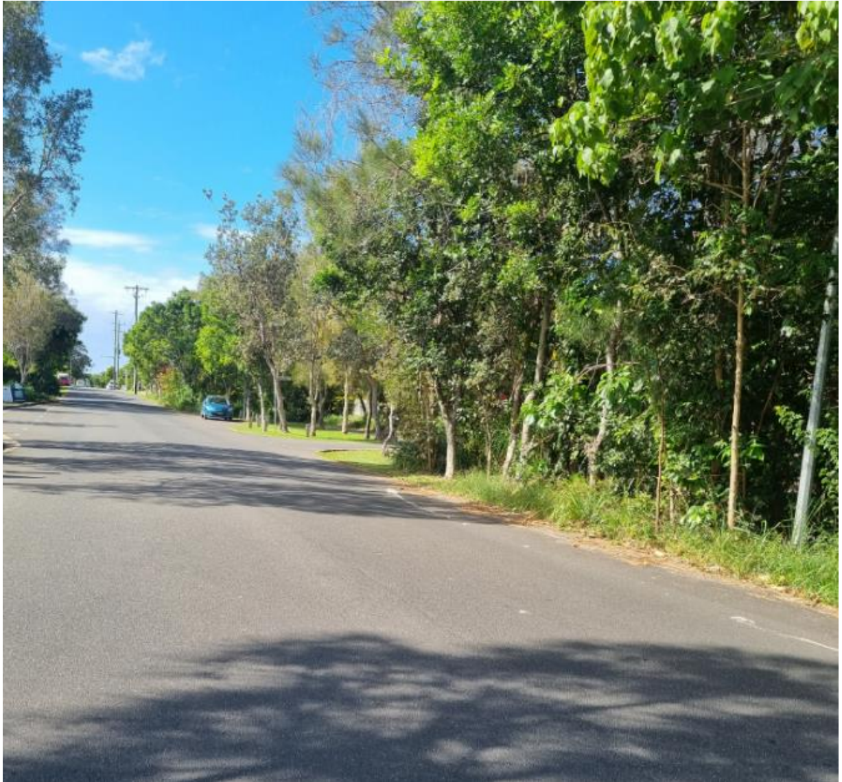
Figure 7 (above): Approach/stopping sight distance (Northbound, Bayshore Dr) at the northern intersection of Bayshore Dr/Bayshore Ln.