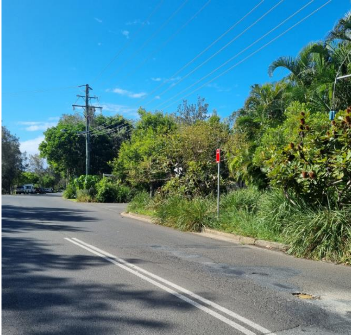
Figure 5 (above): Approach/stopping sight distance (Northbound, Bayshore Dr)