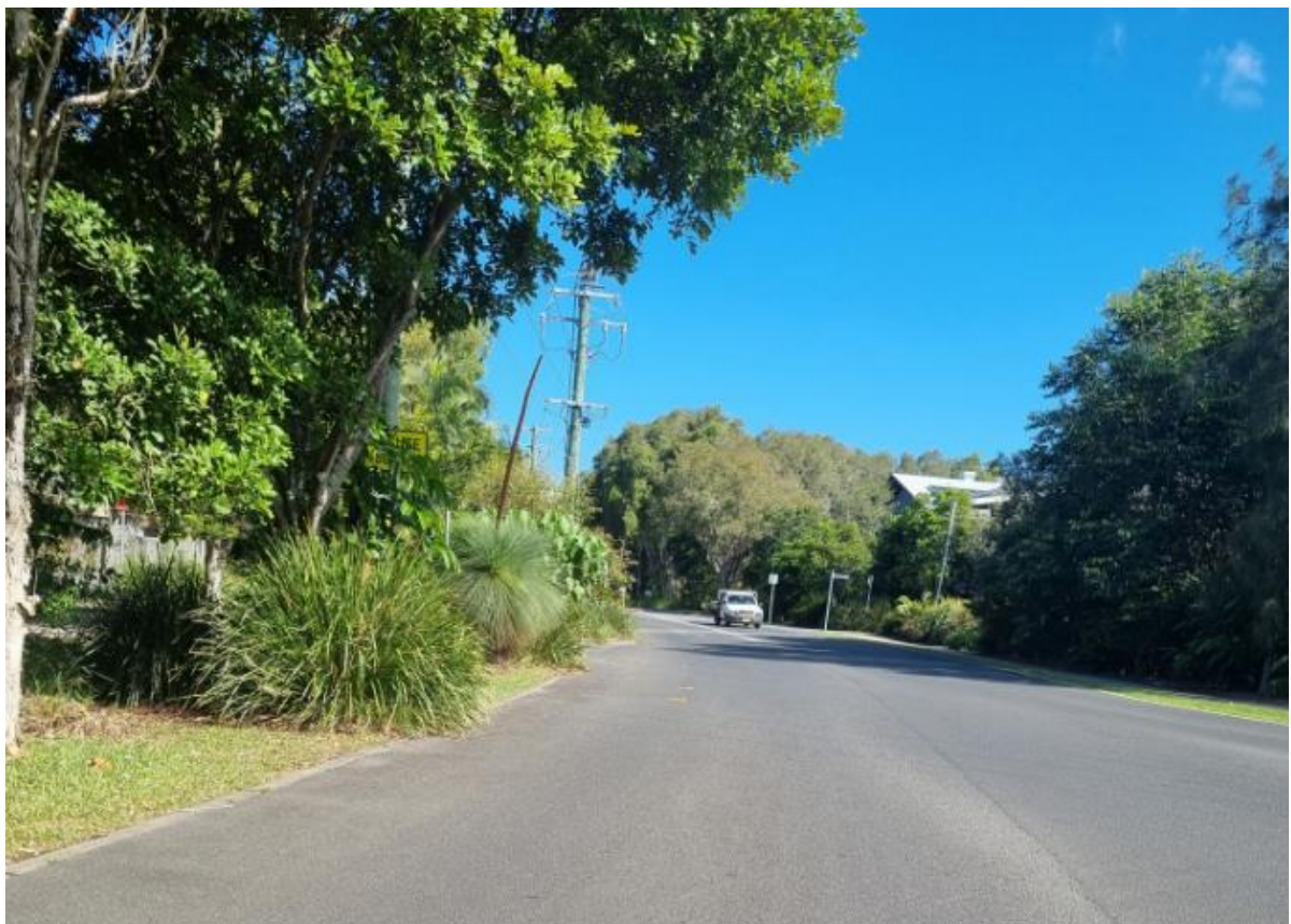
Figure 3 (above): Approach/stopping sight distance (Southbound, Bayshore Dr)