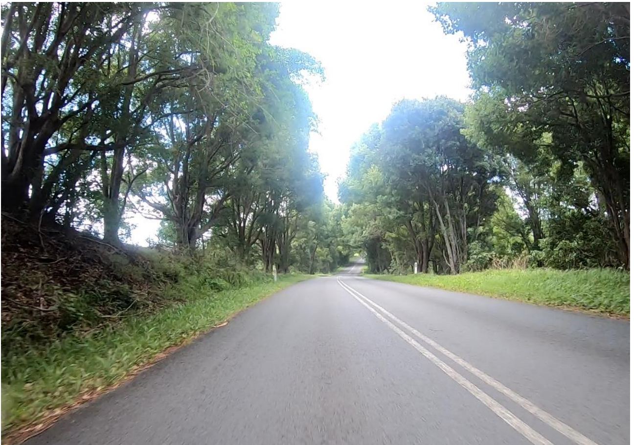
Figure 4: Coolamon Scenic Dr typical roadside environment (cut batter, large trees)