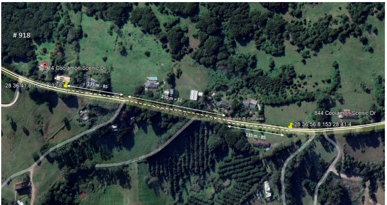
Figure 2: Proposed location (918 Coolamon Scenic Dr)

While these locations do provide adequate sight distance for overtaking (refer to attachment 4, TfNSW advice) the roadside environment is very unforgiving and does not provide adequate shoulder should a mistake be made by an overtaking driver to avoid an oncoming car.