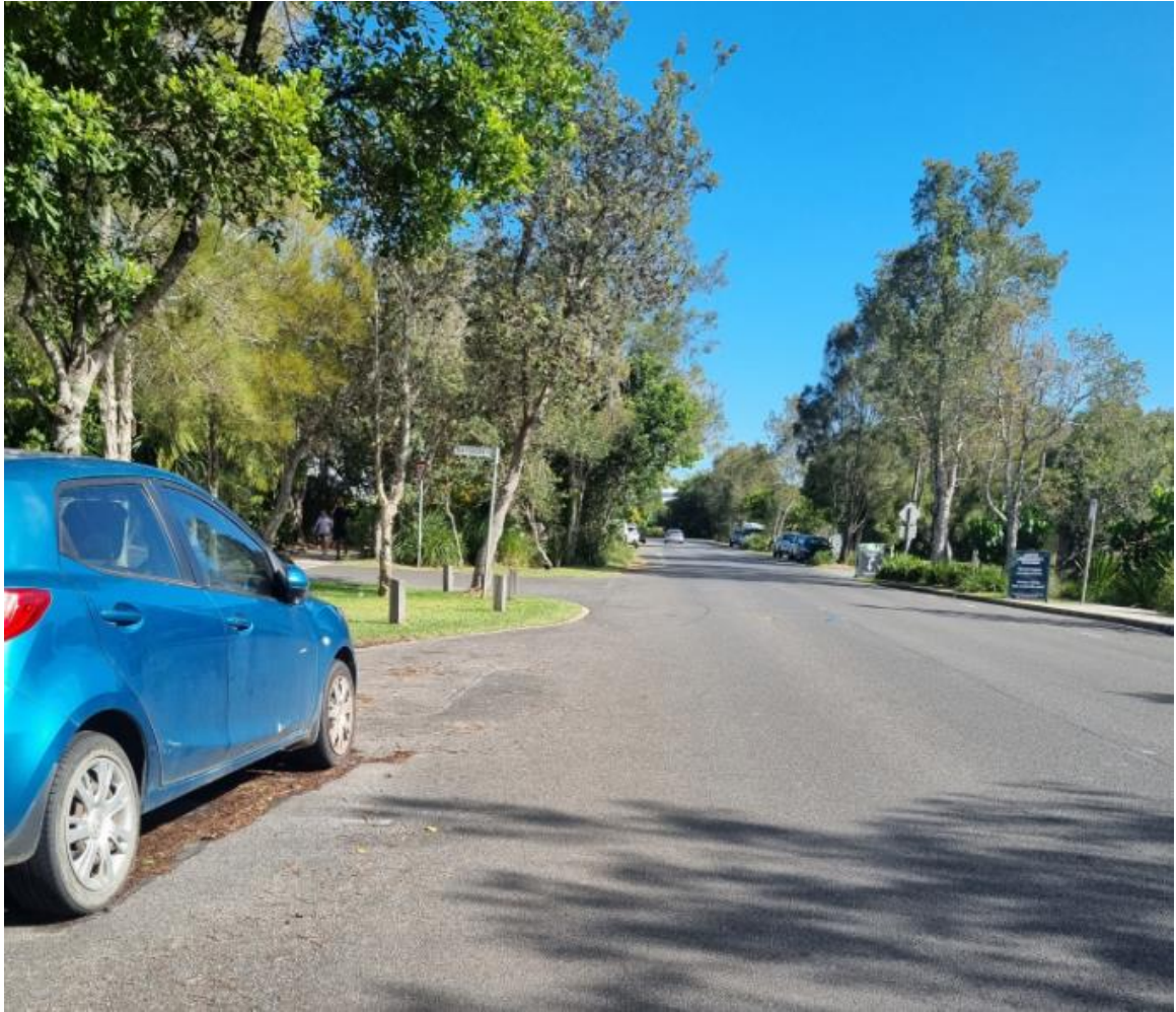
Figure 8 (above): Approach/stopping sight distance (Southbound, Bayshore Dr) at the northern intersection of Bayshore Dr/Bayshore Ln.