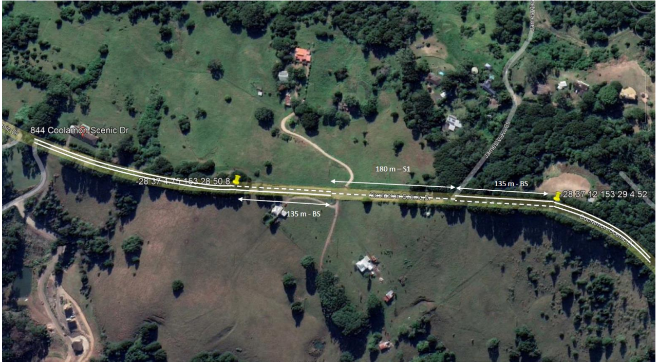
Figure 1: Proposed location (844 Coolamon Scenic Dr)