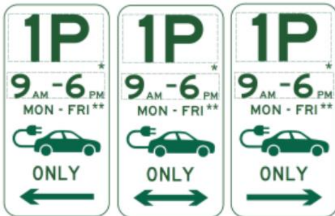
Figure 2: Optimal zone EV charging mapping, NSW Climate and Energy Action Master Plan