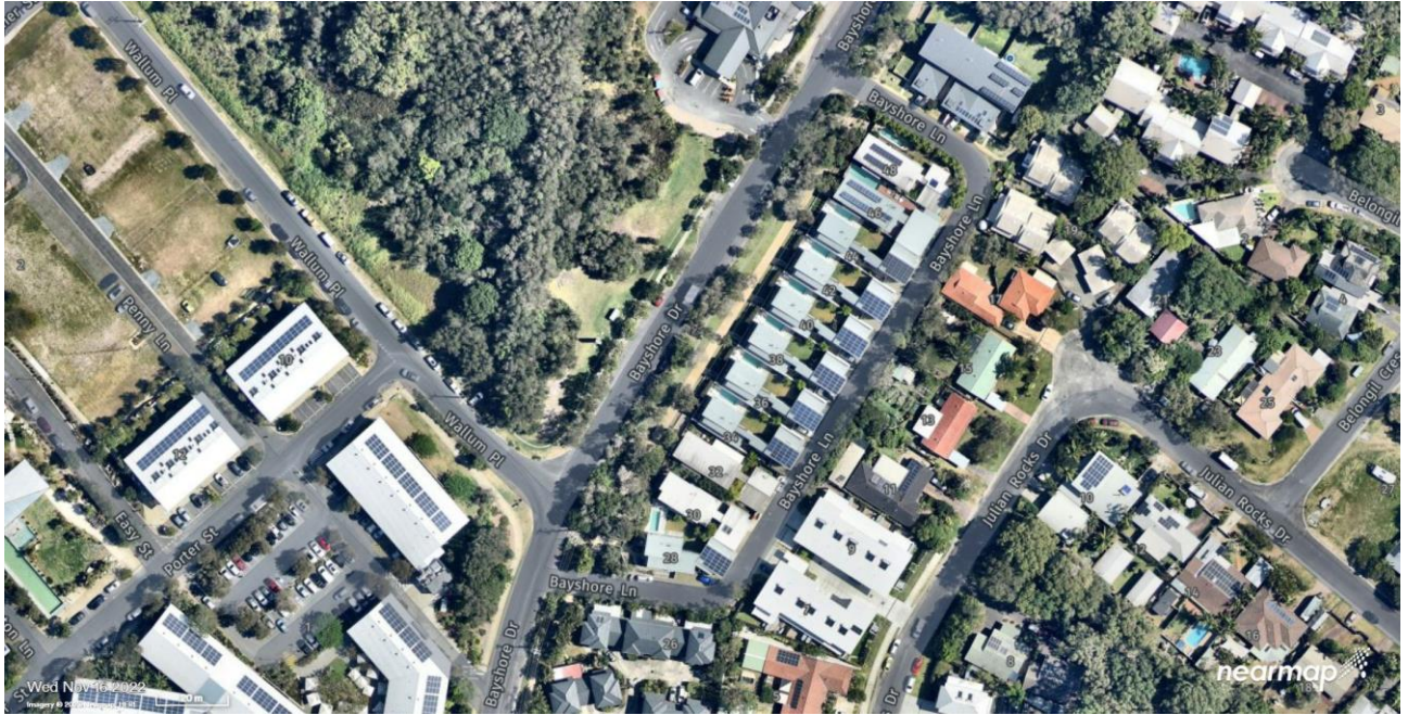
Figure 2: Bayshore Lane formation

Council staff have been onsite and observed numerous road safety concerns regarding the southern intersection with Bayshore Drive.