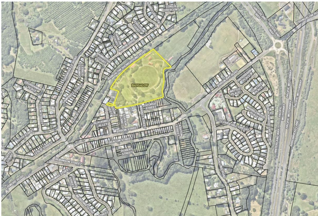
Figure 1 – Locality

Byron Writers Festival is proposed to be held in Bangalow Showgrounds from the 11 th to the 13 th of August 2023. In previous years this event was held adjacent to the Elements Resort on Bayshore Drive, Byron Bay.