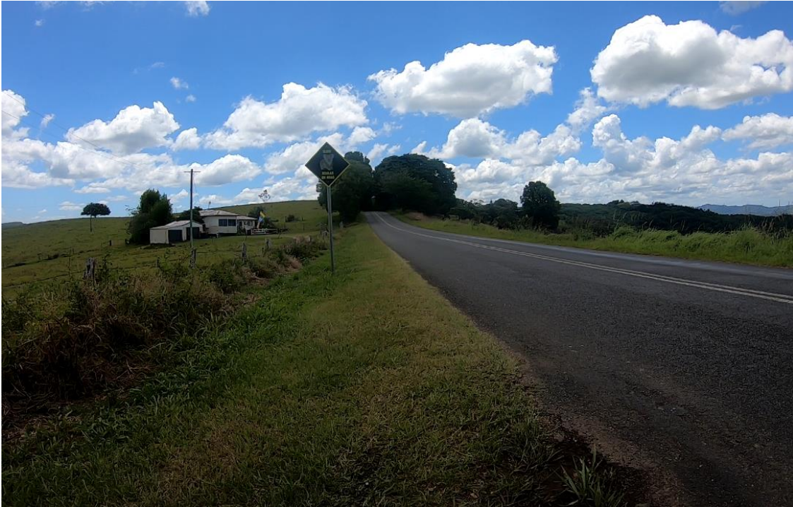
Figure 3: Coolamon Scenic Dr roadside environment (steep fill batter, no shoulder)

been shown to drive at speeds over the posted speed limit (refer to attachments 1 and 2).