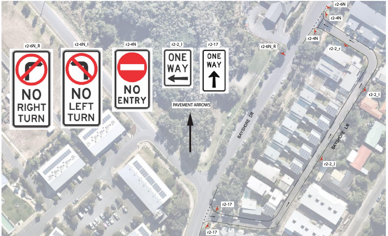
Figure 10: One-way concept Bayshore Ln, Byron Bay