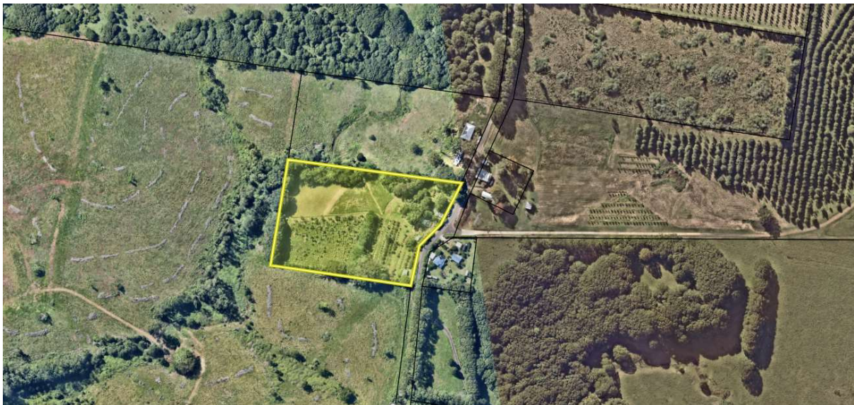
Figure 1: Subject land

This Planning Proposal relates to 114 Stewarts Road, Clunes legally described as Lot 10 DP 586360, as shown below in Figure 1. There is an existing unauthorised dwelling on the land which also encroaches onto the Stewarts Road reserve owned by Council (Figure 2).