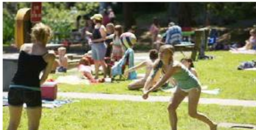
Open lawn areas provide space for a wide range of activities, including picnics, informal games or relaxing.