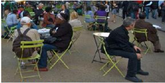
Movable furniture enables interaction with space and a unique opportunity to engage with the public realm.