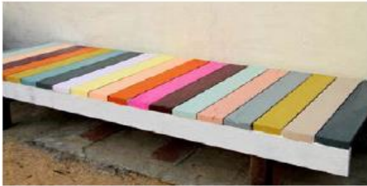
Colour can be used to reinforce key spaces and create vibrancy within selected areas e.g. laneways.