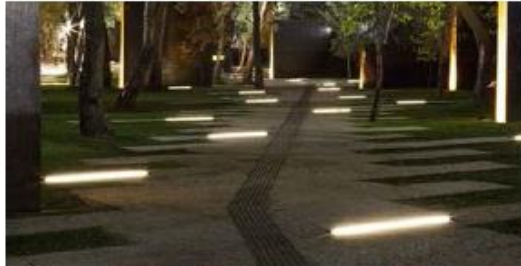
Lighting adds interest to public space and also extends usability into the night.