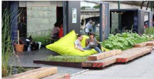
Utilising recycled materials is in tune with the ethos of the Bay community, it can also be cost effective.