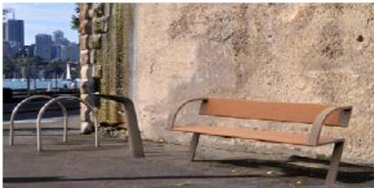
Street elements should be consolidated and co-located to avoid cluttering the street.