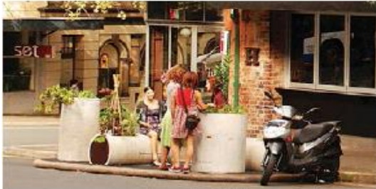
Temporary spaces explore potential future use and can be economical ways to improve the public domain.