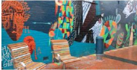
Natural materials and neutral colours are sympathetic to Byron's surrounding environment.