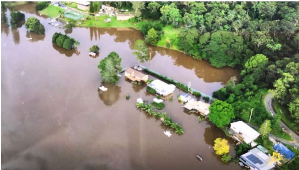
Figure 1 Aerial view of flood affected properties on the Hawkesbury River

Correspondence, Ms Rochelle Miller, Private individual, to the secretariat, 2 June 2022.