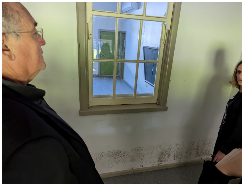
Figure 11 Committee members inspecting mould in affected classrooms at Condong Public School