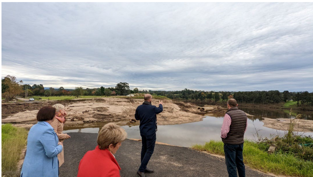
Figure 1 Committee members inspecting the scale of erosion at Cornwallis

Photo by committee secretariat, taken during site visit to Cornwallis, 3 June 2022