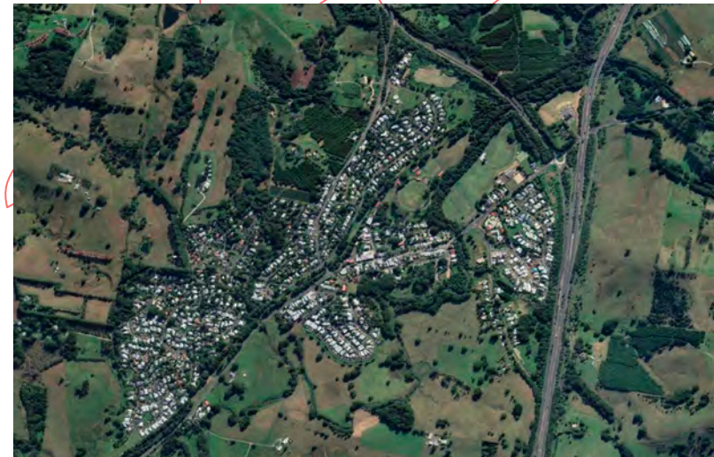
Figure 3. Location Bangalow Sports Fields