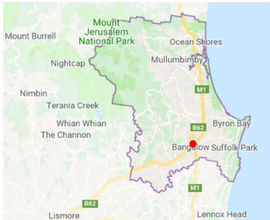
Figure 1. Location of Bangalow in the Shire.

This Plan of Management relates to the land known as the Bangalow Sports Fields, situated in the south of the Shire at 5 Byron Bay Road, Bangalow 2479. See the following images.