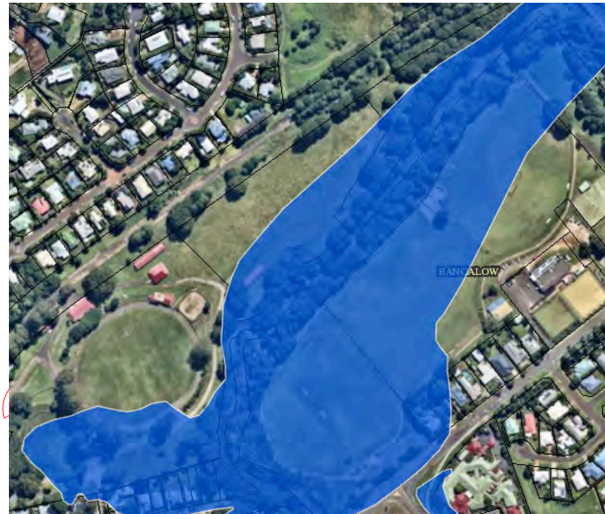
Figure 9. Bangalow Sports Fields Flood overlay

Maps showing the two planning overlays are provided below. The Bangalow Sports Fields has a flood zone overlay that covers most of the Sports Fields except for the south-eastern corner.