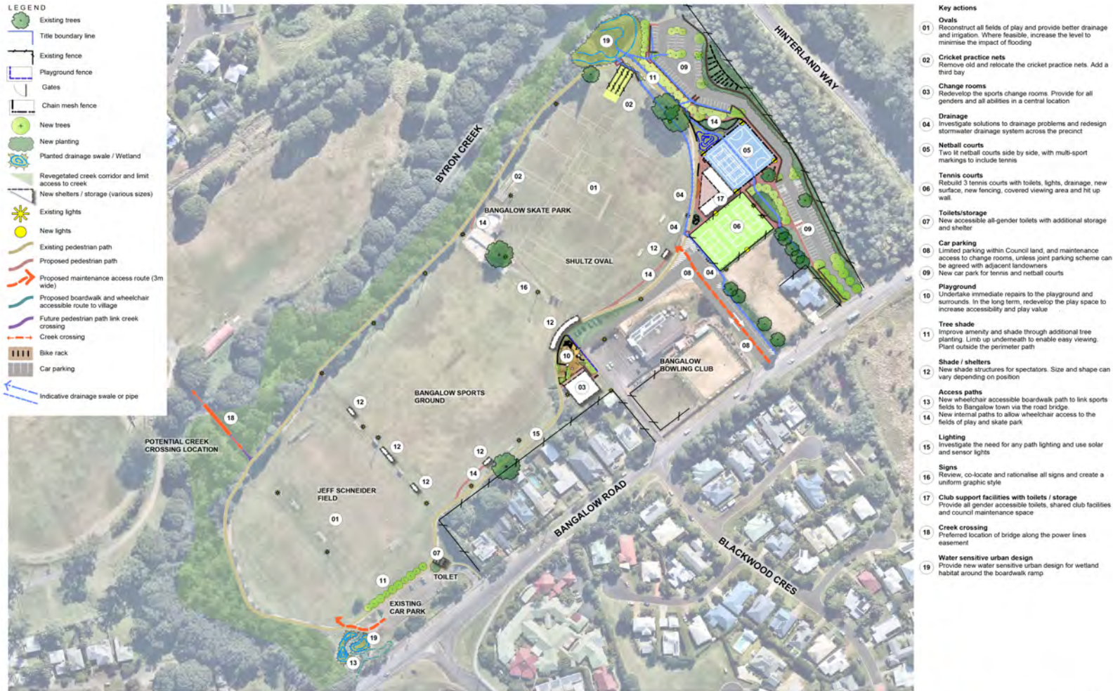
Figure 13 Landscape master plan