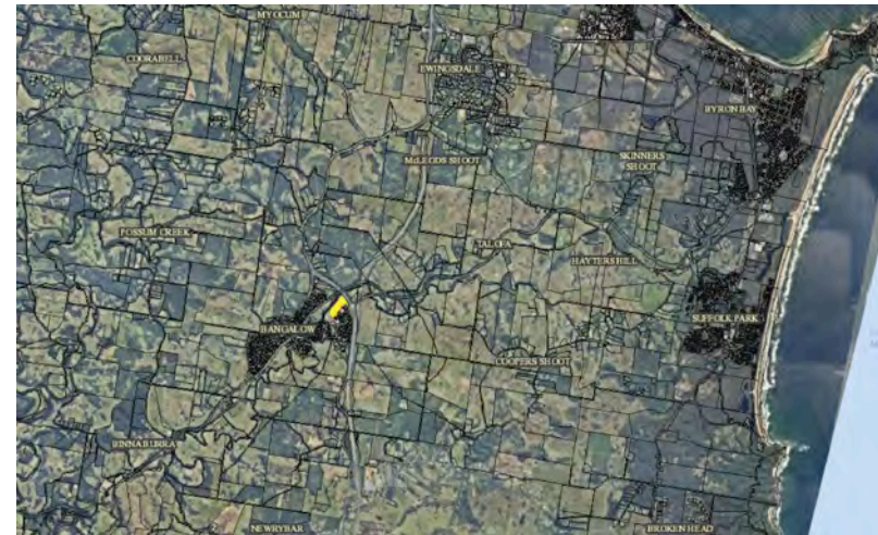
Figure 2. Bangalow Sports Fields (yellow) locational context