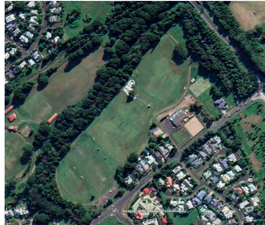
Figure 4. Aerial view of Bangalow Sports Fields

The Reserve includes a skate park, perimeter path, playgrounds and associated open green space and the revegetated area along the creek.