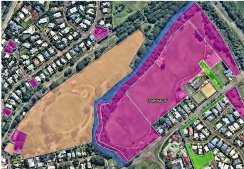
Figure 5. Individual parcels of Council and Crown land in and around the Bangalow Sporting Fields

Adjacent to the Bangalow Sports Fields is two parcels of Crown land. These are the Showgrounds (orange) and the Byron Creek (blue). See Figure following.