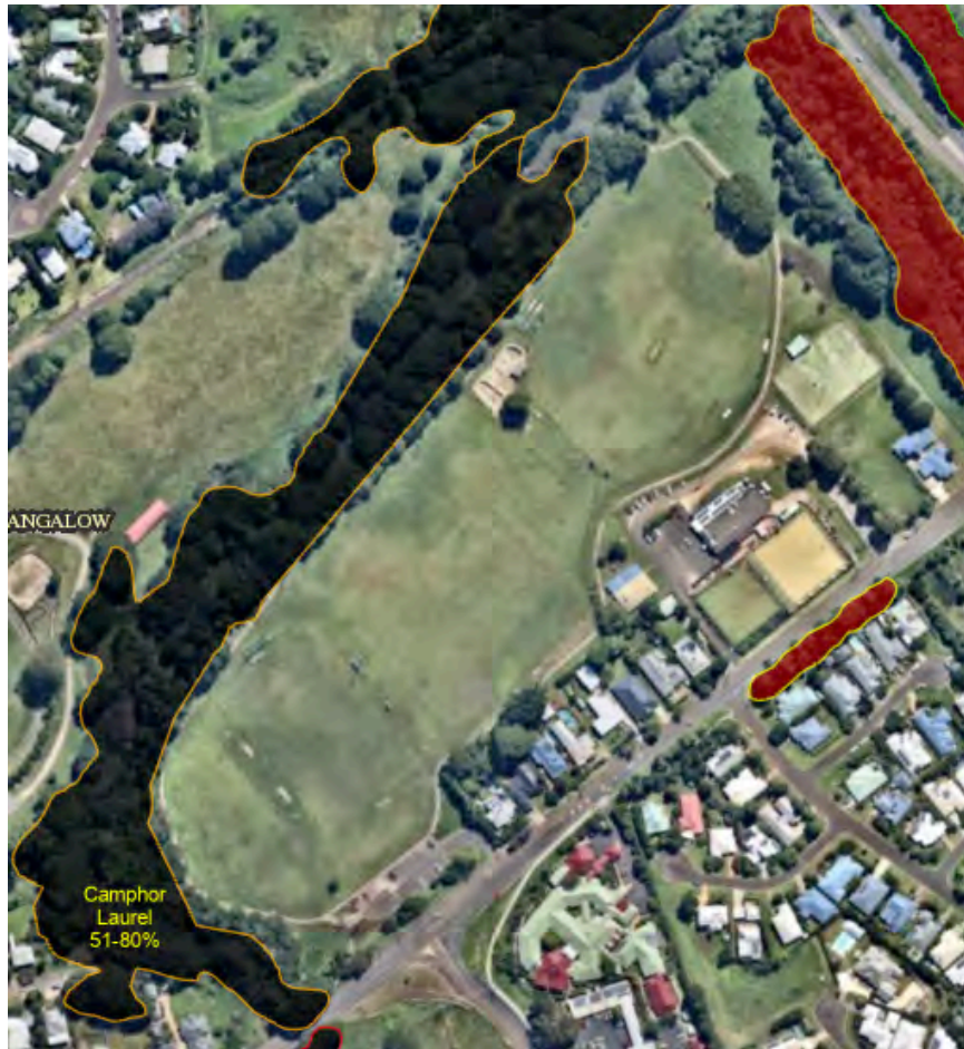
Figure 10. Bangalow Sports Fields Camphor Laurel overlay (yellow border)