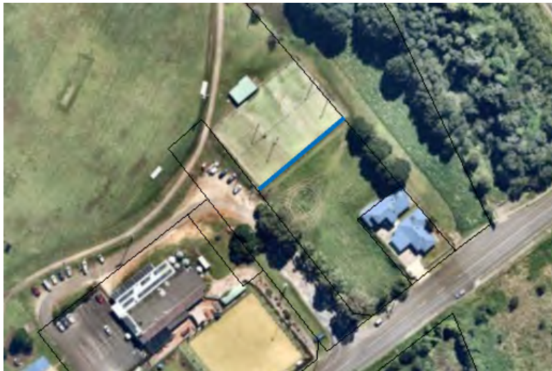
Figure 7. The boundary between the tennis courts and the proposed motel site (blue line)

The parcel of operational land (which provides access to the Sports Fields) extends into the field of play.