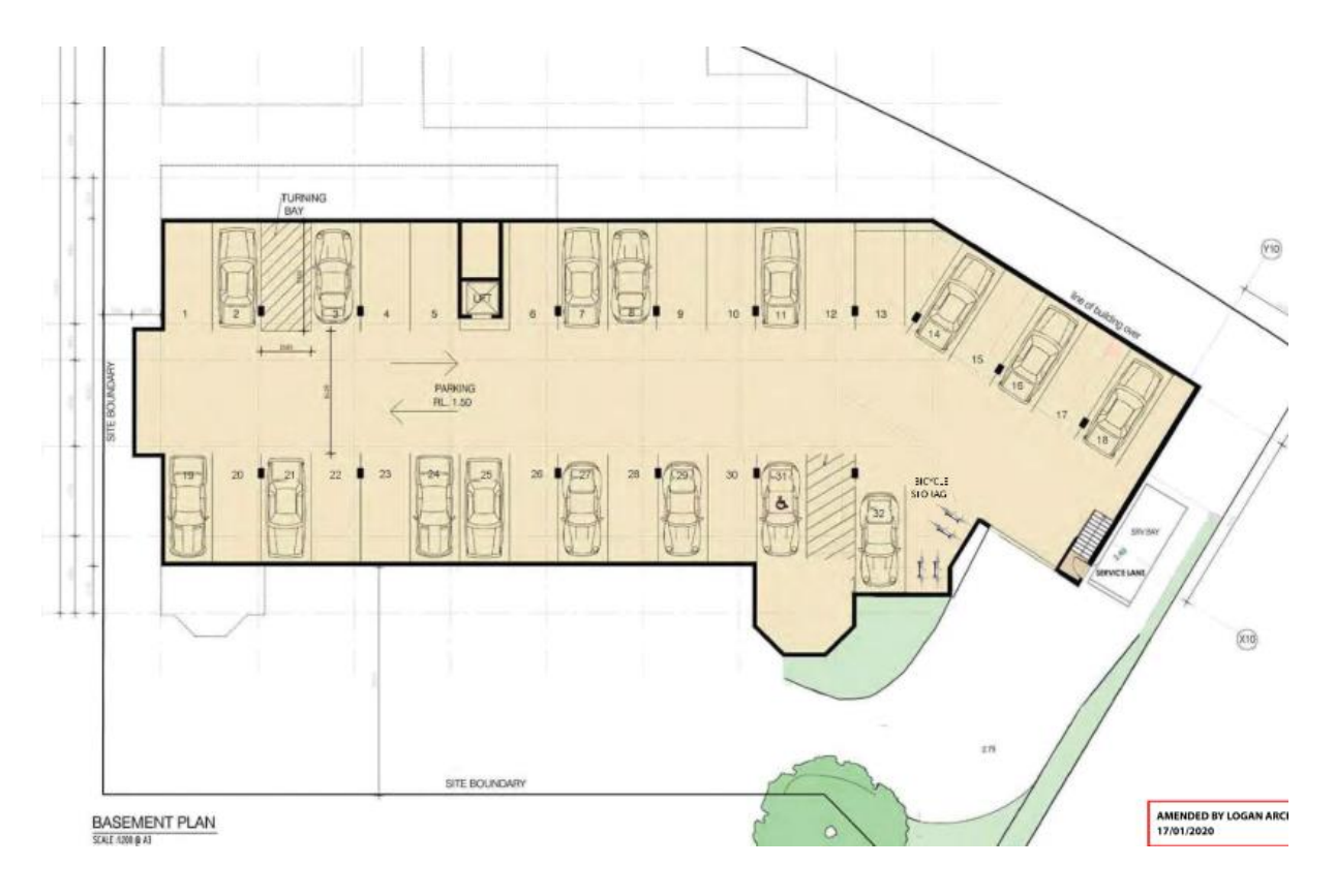
Figure 6: Proposed car parking