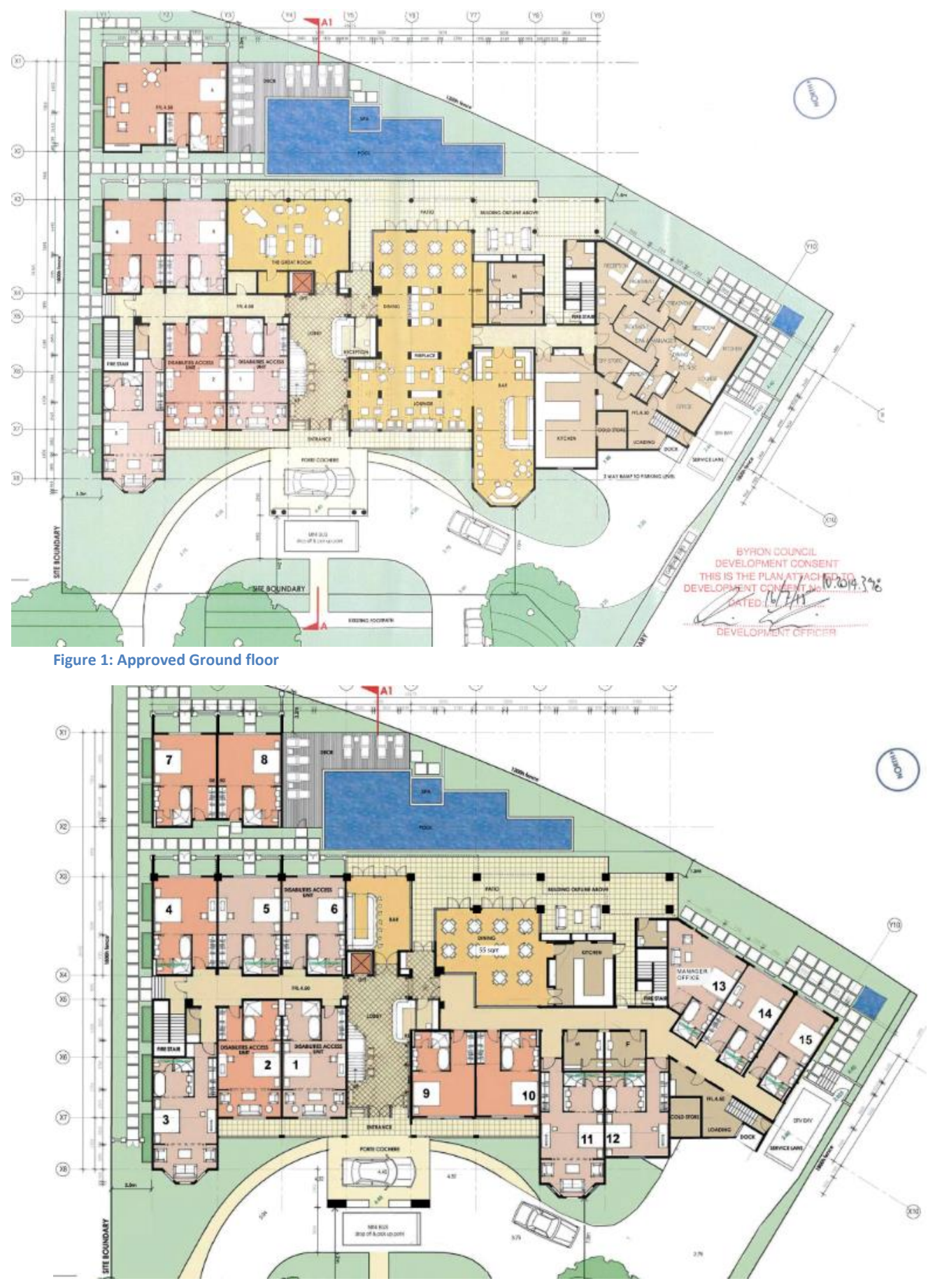
Figure 2: Proposed Ground Floor