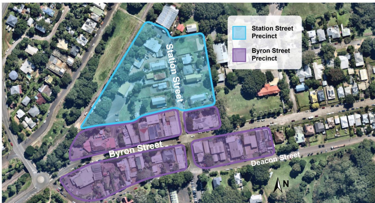
Figure E2.4.1 – A map of the precincts in the Bangalow Village Centre