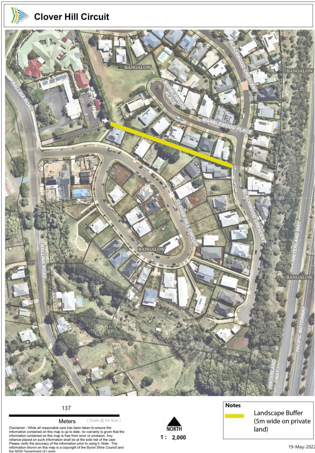
Figure E2.5.1 – Landscape buffer Clover Hill Circuit