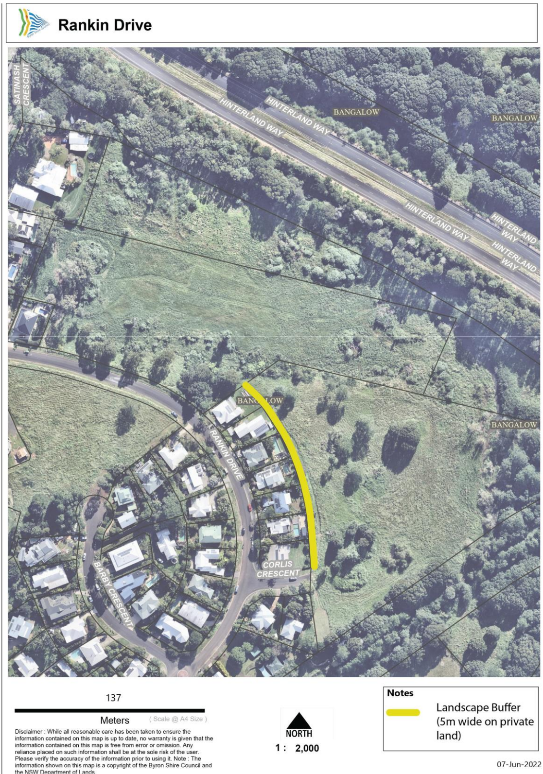
Figure E2.5.2 – Landscape buffer Rankin Drive