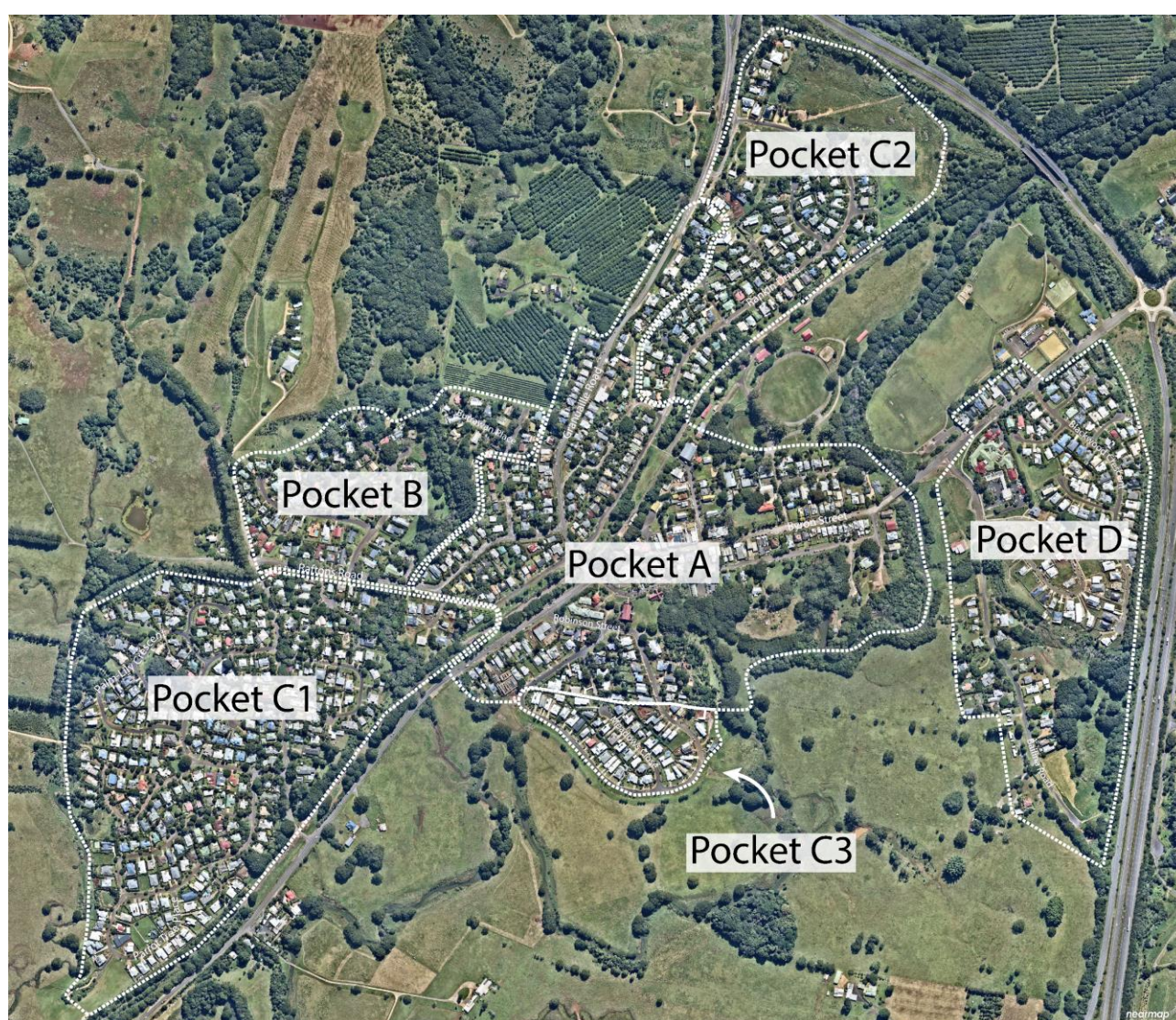
Figure E2.2.1: Overview of Character Narrative 'Pockets' in Bangalow

The statements divide the residential areas into pockets based on context, including topography, setting, heritage, streetscape, land uses and built form.